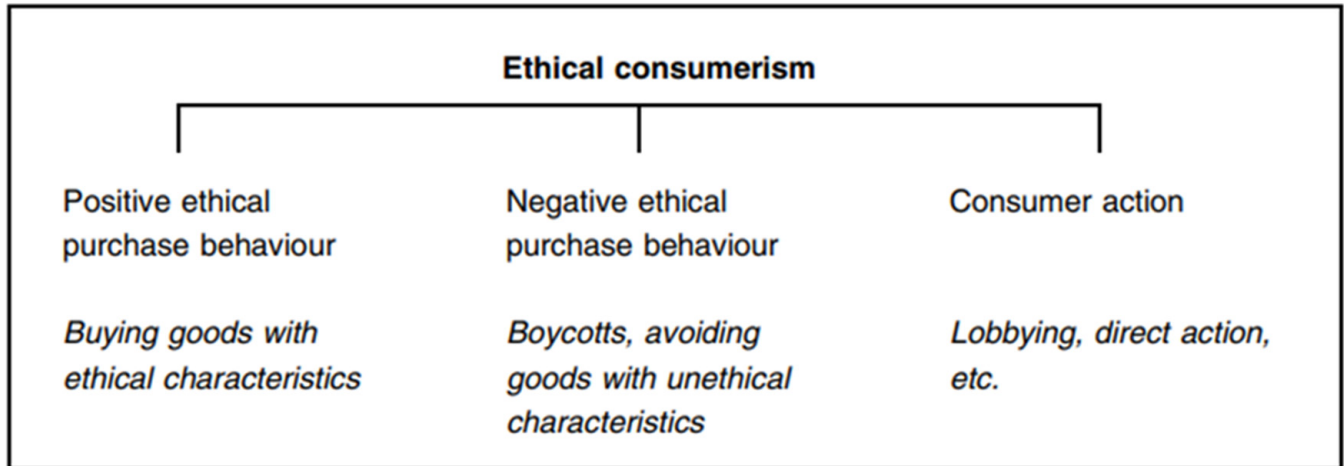
Figure 1. Three types of ethical consumerism.

high ethical purchase intention. Cynical and disinterested consumers have a high level of ethical awareness but nevertheless have no purchase intention. Finally, careful and ethical consumers obtain sufficient information about the social responsibility of organisations and are highly ethical in their purchasing activities.