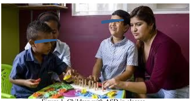
Figure 1. Children with ASD in classes