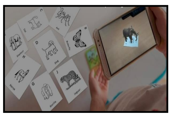
Figure 2. RA image in ARAnimals software

An example of RA application using a smartphone is shown in "Fig. 1"