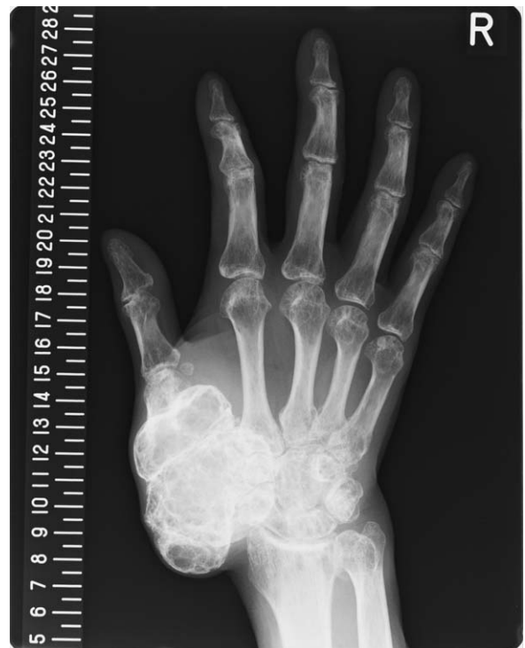
Figure 4. X-ray image of the right hand prior to surgery. The metastatic lesion to the trapezium had increased in size, formed new bone resembling a birdcage, and become involved the first metacarpal bone.