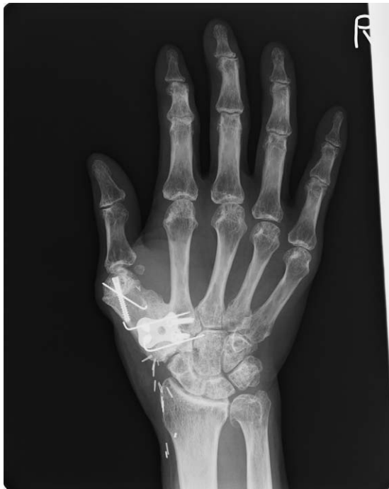
Figure 7. X-ray image of the right hand 12 months postoperatively. The grafted scapular bone had become united with the second metacarpal bone and trapezium.

size of the gastric cancer had substantially decreased and that no other distant metastases were present. Histological analyses of specimens obtained by multiple needle biopsies of the right hand revealed no viable tumor cells. The patient complained of an unaesthetic appearance of the right hand and a tingling sensation over the dorsal thumb. The thumb and wrist function were well preserved in spite of the huge size of the base of the thumb. The Disabilities of the Arm, Shoulder and Hand (DASH) score was 21.67, and the side pinch power in the right hand was 8.7kg.