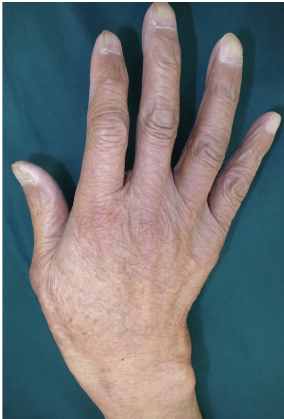
Figure 5. Photograph of the right hand 12 months postoperatively. The patient was satisfied with the appearance of the reconstructed hand.