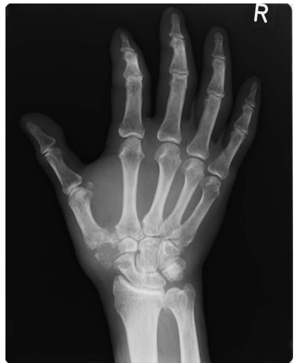
Figure 2. X-ray image of the right hand at the initial visit. The patient had an osteolytic lesion in the trapezium.