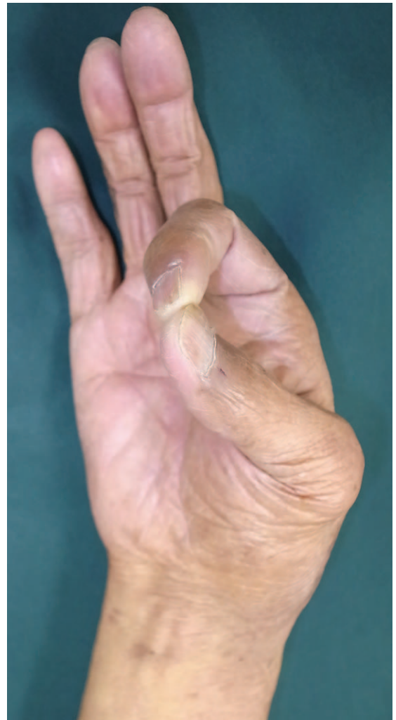
Figure 6. Photograph of the right hand 12 months postoperatively. The patient was satisfied with the function of the hand.