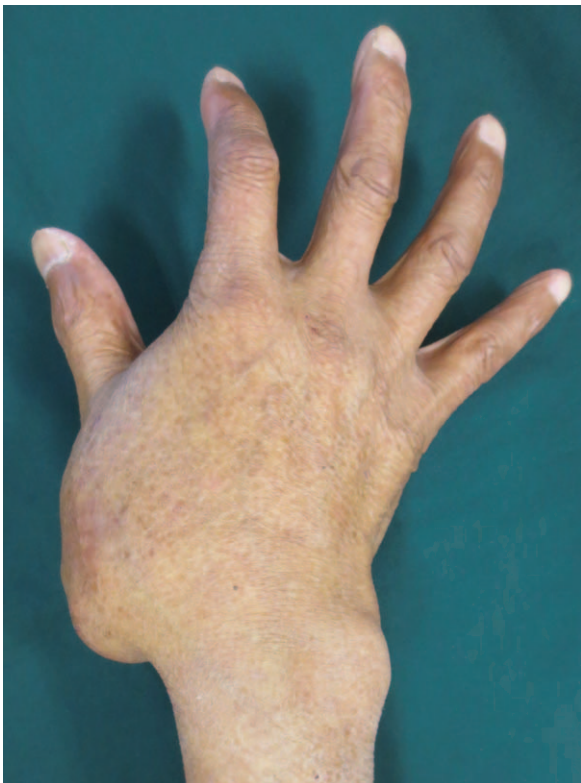
Figure 3. Photograph of the right hand prior to surgery. The patient complained of an unaesthetic appearance of the right hand.