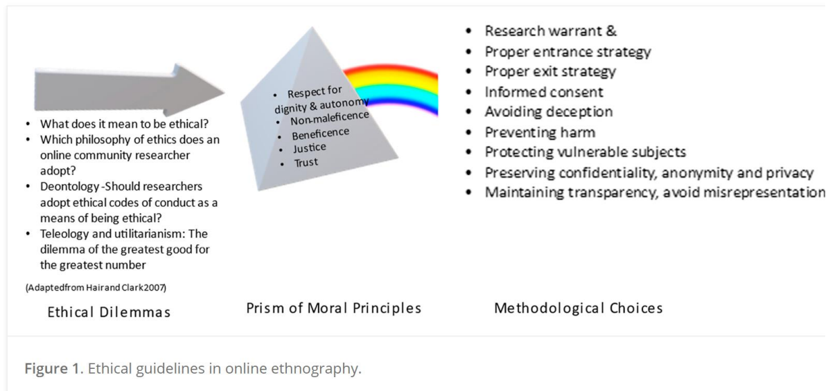
Figure 1. Ethical guidelines in online ethnography.