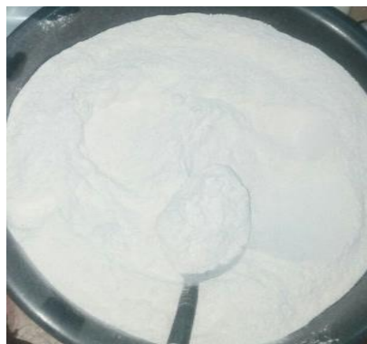
Figure 2. Freshly produced cocoyam flour