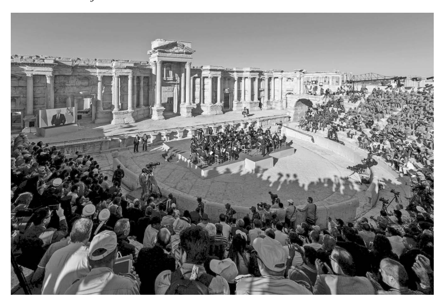
Figure 7.1 Russian conductor Gergiev leads a concert in the ancient Roman theatre in Palmyra.