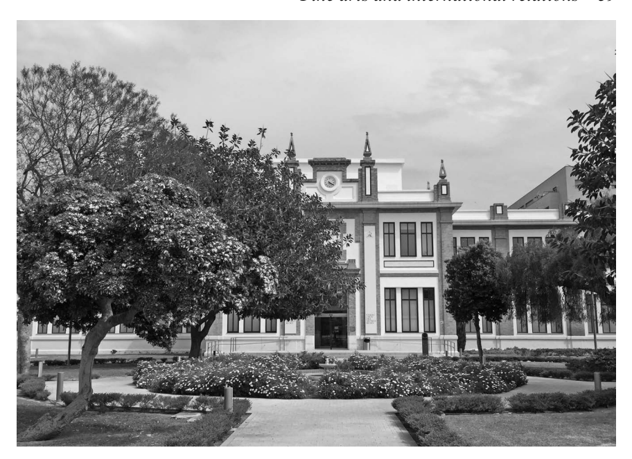
Figure 3.1 Colección del Museo Ruso in Málaga (Julia Bethwaite).

history, and over twenty temporary exhibitions (Colección del Museo Ruso, 2020). While the annual exhibitions have been thematic, the temporary exhibitions have often been dedicated to individual artists, such as Vasili Kandinsky and Kazimir Malevich. These exhibitions have also attempted to highlight the Spanish influence on Russian art, as is suggested by the exhibition 'Cervantes in Russian Art'.' Besides displaying Russian fine art, the exhibitions have contributed to increasing and widening their visitors' knowledge of Russia by pointing out unexpected and less known factors about its culture and history. For example, some exhibitions have guided visitors through the history of the Romanov family or introduced them to famous cultural characters, such as the poet Anna Akhmatova and the filmmaker Andrei Tarkovsky. Besides exhibitions of visual art, the Colección del Museo Ruso also offers cultural activities in the form of music, cinema and workshops, which are more directed towards the local audience rather than tourists (Aguilar, 2017).