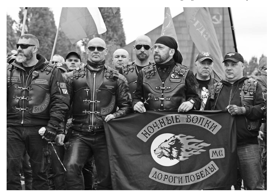
Figure 4.1 Night Wolves take part in celebrations to mark Victory Day in Berlin.

towards the Soviet military burial grounds. Yet, he expressed concern that this tradition might be erased in the future. He asserted that at some commemorative activities that take place in Germany, the role of the Red Army in overcoming Nazism was either diminished or omitted. Instead, attention has been paid to the contribution of the British and American forces, for example, in liberating concentration camps and establishing democracy in post-war Germany. Moreover, he mentioned that the German authorities, in general, focus more on the Jewish genocide than on the annihilation of the Slavic people. He objected to the German authorities' decision to ban the Night Wolves from entering Germany and called on Russia to actively defend its historical memory (TASS, 2015) (see, Figure 4.1).