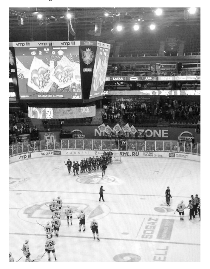
Figure 10.1 Jokerit playing their 50th anniversary game against Dynamo Minsk in October 2017.