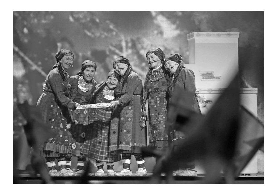
Figure 8.1 The performance by the Buranovskie Babushki in 2012 (Reuters, 2012).

Just after hosting the ESC, Russia was subsequently represented in the contest by some less commercial entries – which is not an uncommon strategy used by national broadcasting organisations that have recently staged the contest, so as to avoid winning it too soon again and having to once more bear the expense of hosting it. However, over the course of the 2010s, Russian television increasingly invested in its ESC acts with what appeared to be the intention of again winning the contest. Since 2013, Russian ESC entries have been selected internally by Russia 1 or Channel One alternatingly, without a public national final or audience vote, which allows the television companies to entirely determine how Russia is represented. During this time, all Russian entries apart from one have placed in the top ten of each ESC edition. Unlike in the 2000s, Russian entries have not engaged with overtly camp aesthetics, but rather embraced more traditional gender iconography, as in the performances by the Buranovskie Babushki (Buranovo Grannies) in 2012 (see, Figure 8.1) or the teenage Tolmachevy Sisters, former winners of the Junior Eurovision Song Contest, in 2014 (Kazakov and Hutchings, 2019, p. 139). At the same time, Russian entries have continued to engage with the over-the-top performance tradition of the ESC with striking performances that demonstrate Russian