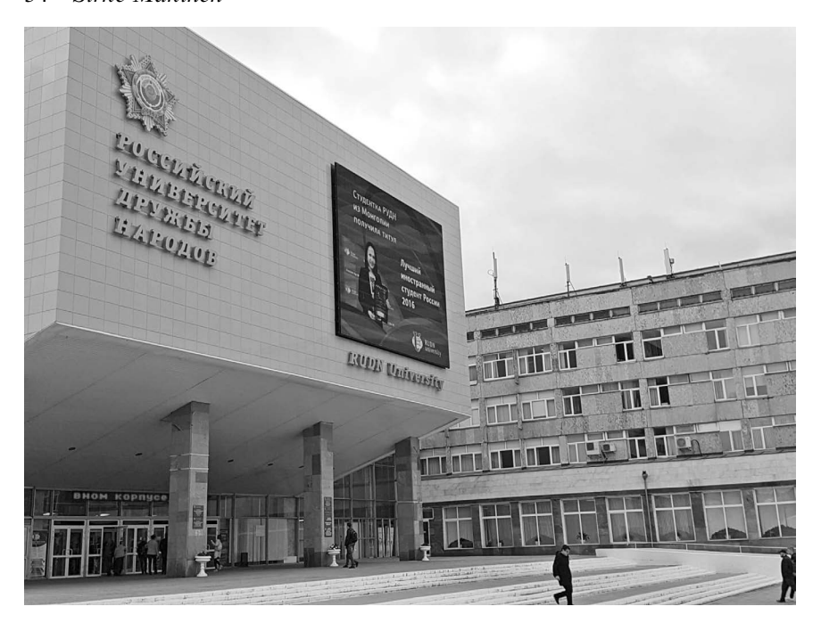
Figure 2.3 People's Friendship University of Russia has been the key recipient of international students in Russia since the 1960s.

of education is directly linked to the image of Russia. For example, one of the interviewees argued that 'if foreign partners learn to know the university [name of the university omitted], and if this experience is positive, then it is reflected as a positive image of the country' (RUS-2, 2016). Another interviewee was convinced of the power of personal experience to change the image of Russia: 'there are a lot of negative things about Russia [...] young people who have been here, they understand that it is not so [...] our former students [...] they have maintained good relations towards Russia. They understand that there is propaganda, and then there are people' (RUS-9, 2018). This is also linked with the idea of graduates as 'ambassadors': 'Our graduates are ambassadors of our university, Russian language and Russian education as a whole' (RUS-8, 2017). There were direct references in the interviews to soft power as well; for example, it was declared that when educating the elites of foreign countries 'we are agents of soft power' (RUS-8, 2017). Similar to the Soviet period, this also had to do with disseminating values: 'any highly developed country, and particularly one of the leaders, to which Russia belongs, should disseminate its values to the world as much as possible' (RUS-10, 2016). As for interactions with alumni, the Peoples' Friendship University of Russia claims to have a well-functioning system of interaction with their Russian and international alumni (PFUR,