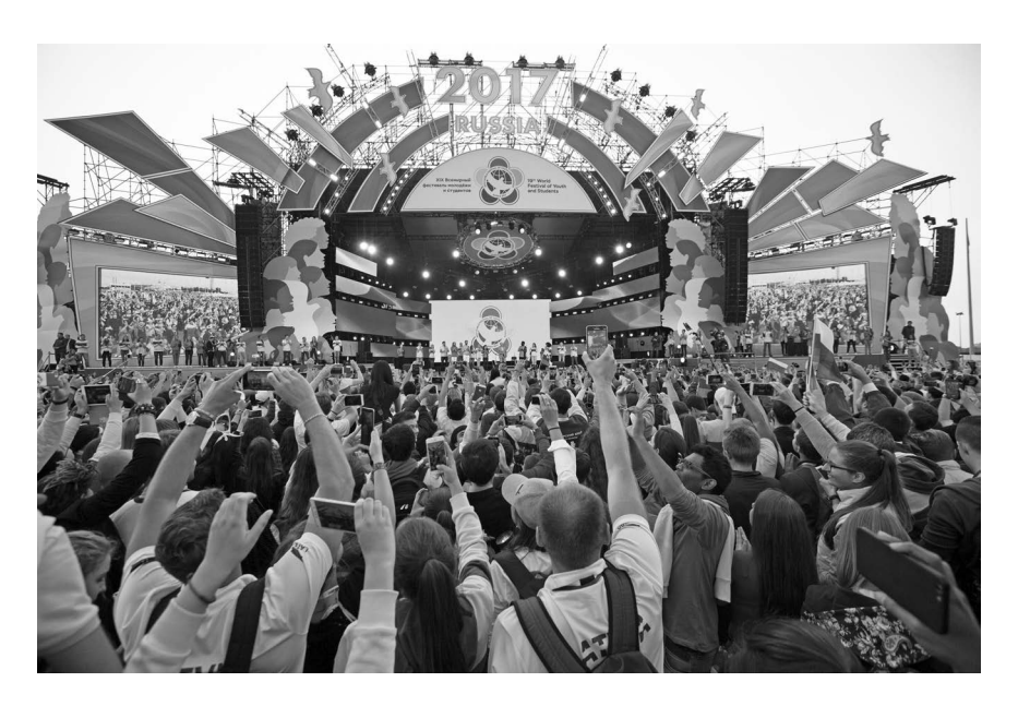
Figure 9.1 The 19th World Festival of Youth and Students in Sochi on 14–22 October 2017.

The Sochi Youth Festival was the Russian political leadership's endeavor to target foreign and domestic youth as 'the future leaders', promote Russia as a hospitable, modern and generous state, educate volunteers for future international events, as well as find a use for the costly Olympic infrastructure. The festival was a top-down state event for which the government allocated 4.5 billion roubles, and it was organized by a state body, the National Youth Council of Russia (TASS, 2017). According to the World Federation