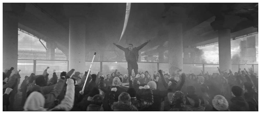
Figures 6.1 & 6.2 Stills from Bondarchuk's Attraction.