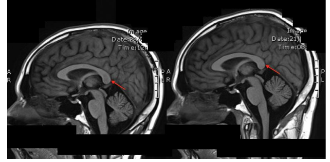
Sagittal T1-weighted MRI showed hypointense lesion (left) of the splenium of the corpus callosum. Repeat T1 MRI 5 weeks later showed regression (right) of previous intensity in the splenium of the corpus callosum.