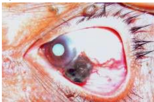
Figure 1: Conjunctival malignant melanoma of the left eye on initial presentation

With an informed written consent, the patient presented for surgery. Wide local excision of the tumour, with a clear margin of 4mm was achieved using no touch technique followed by double freeze thaw cryotherapy of the conjunctival margins and the scleral bed. The residual conjunctival defect was closed with primary closure using a second set of instruments to avoid contaminating the field with the previous instruments. Postoperative recovery was uneventful (Figure 2). The cataract was left untreated.