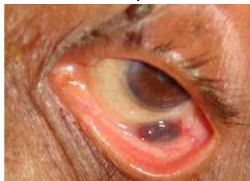
Figure 4: Recurrence after one year

The patient was taken up for surgery again and wide local excision similar to the primary surgery was done, using adjunctive cryo-application considering all surgical precautions. Histopathology confirmed it as malignant melanoma. A week later, she underwent an uneventful cataract surgery in the same eye with good visual result. The patient has participated in regular follow up, without any further problems, for more than two years to date.