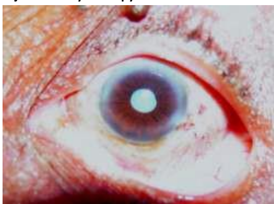
Figure 2: Post operative outcome after wide local excision with adjunctive cryotherapy

Histopathology of the lesion showed sheets of polyhedral melanocytes with large hyper chromatic nuclei and clumps of coarse melanin granules in the cytoplasm (Figure 3). The excision margins of the specimen were reported as free from tumour cells.