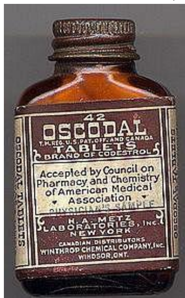
Figure 2: A bottle of the original vitamins invented by Casimir Funk. The name OSCODAL was derived from OS-bone CODA-covitamins D and A, L-lozenge