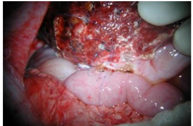
Figure 2: Microscopic photo of hepatica enteric anastomosis

or the (combined micro vascular anastomosis technique). 5,18 All suture knots are tied extra luminal. Modification of the MBR technique is discussed in the previous report and biliary reconstruction classification according to number of graft duct opening and when there is two or more graft. The manner in which these ducts were reconstructed (with or without ductoplasty) and type of conduits used for reconstructing the biliary tree is also discussed in detail. The conduit used could be either recipient (right, left or common) hepatic duct or the jejuna loop. The size of the duct openings and IDD (Intra Ductal Diameter) duct opening are measured with calliper. The size of the opening created in jejunal roux n Y limb is always patterned to that of hepatic ducts in the graft (Figure 2).