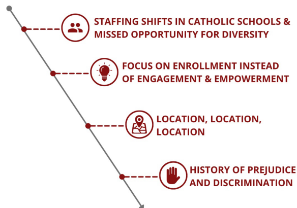
Historical Factors Driving Low Hispanic Educator Representation

Today, 29.1 million Hispanic Catholics (about 47% of all Hispanics self-identify as such) constitute about 41.6% of the nearly 70 million Catholics in the United States ( Smith et al., 2019 ). These numbers suggest that the future of Catholicism in this country will be significantly defined by Hispanics. In 2016, the National Catholic Education Association (NCEA) reported that 7% of all faculty (including full-time and part-time teachers and leaders) in Catholic schools self-identified as Hispanic ( McDonald & Schultz, 2016 ). That percentage increased to 9% (14,612) in the 2020–2021 academic year ( McDonald & Schultz, 2021 ). The Cultivating Talent report provides a closer look at who Hispanic teachers and leaders are in Catholic schools, how they enrich these institutions with their presence and their work, the challenges they face, and how these schools support their flourishing.