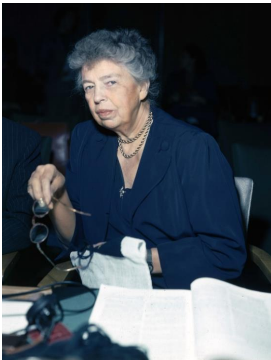
Eleanor Roosevelt

Few people had a greater impact on their generation than Eleanor Roosevelt.