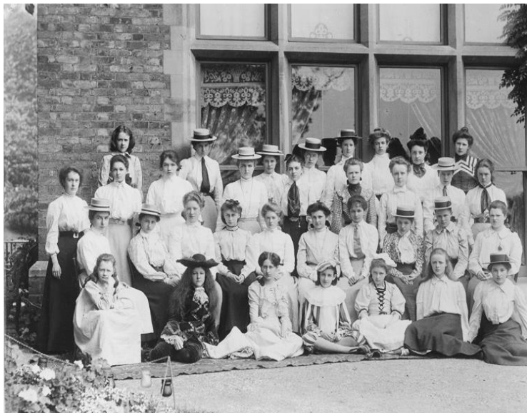
Eleanor Roosevelt at Allenswood Academy, 1900

It was the end of the nineteenth century. New ideas about equality, the plight of the poor