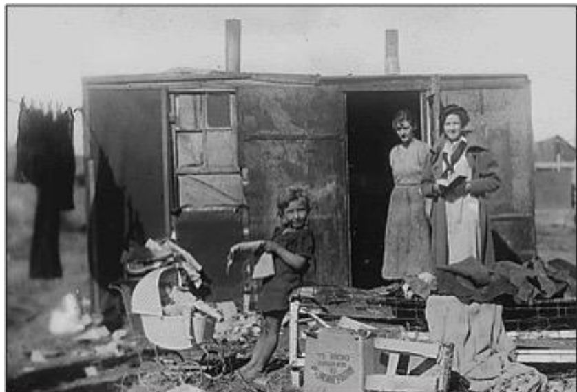
Social Security Administration: Public Health nursing made available through child welfare services, 1935

In his first months in office, he declared a four-day bank holiday; passed the Emergency Farm Mortgage Act, allocating