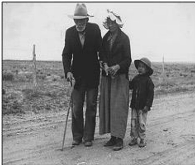
Resettlement Administration, Rural Rehabilitation Photo; "Walking 30 miles to visit family in Santa Fe"; Chomita, New Mexico, 1935. Courtesy of Franklin Delano Roosevelt Library

In 1932, the National Weather Bureau reported 14 dust storms. The next year, they were up to 38. The dust was so thick, that people scooped up bucketsful while cleaning house.