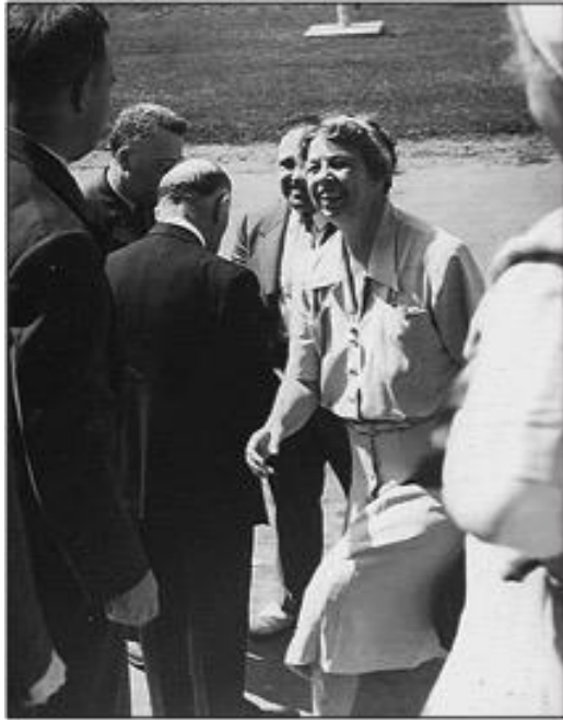
Eleanor Roosevelt visits National Youth Administration in Quoddy Village, Maine, 1941

ice and snow. It is a very pretty scene. But oh, how cold it is here. People can hardly stay comfortable.