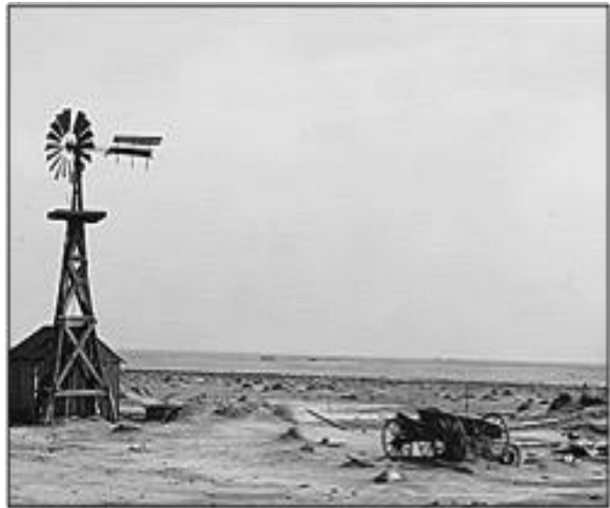
The Dust Bowl: scenes of farms destroyed by draught and soil erosion, 1935.

It was impossible to help them all. Each letter was replied to by a secretary or sent to a department for assistance. About fifty a day were selected for Eleanor to read. Sometimes, she sent a personal check to help a legitimate request. Where she could not respond personally or materially, she gave aid by helping create the National Youth League (NYA) and the youth programs of the Works Progress Administration (WPA). The NYA assisted two million high school and college students. It gave them grants to stay in school. Another two and half million were given jobs. It promoted equality. It gave aid to women and minorities. "It is a question of the right to work," she stated, "and the right to work should know no color lines." Eleanor visited over a hundred NYA sites. She wrote about them in her "My Day" columns and reported about the trips in speeches and radio addresses.