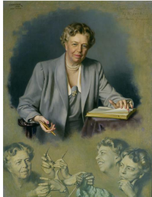
White House Portrait of Eleanor Roosevelt

Eleanor traveled extensively and was her husband's adviser on many issues and his "legs and ears." In the 1940's, she was a co-founder of Freedom House and helped create the United Nations. "Sometimes she endured intense hostility," wrote James McGregor Burns, "for her looks, for not staying home, for her friendships with those of different races and ethnic groups. Newspaper criticism forced her to resign as the unpaid Assistant Director of the Office of Civil Defense in 1942, but she publicized the World War II war effort by visiting service personnel in England, the South Pacific and Latin America."