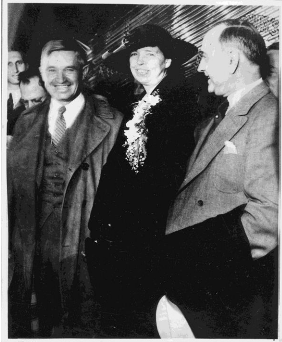
Eleanor Roosevelt and Will Rogers in Los Angeles, California, Courtesy, Franklin Delano Roosevelt Library

For the first time, radio transmitters were mounted to capture a blow-by-blow description