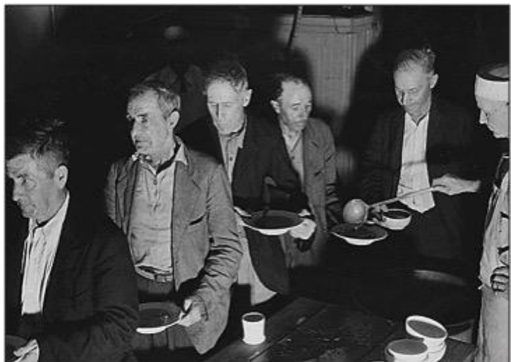
WPA: unemployed shown at Volunteers of America Soup Kitchen: Washington, D.C.

By September 3, 1929, the Dow Jones Industrial Average of major American stocks had increased five times, capping a six-year run of constant growth. Irving Fisher, a well-known economist, stated at the time, "Stock prices have reached what looks like a permanently high plateau." Optimism was strong. Predictions of continued economic growth persisted. Millions bought shares "on margin" or on loan. Brokers often lent more than two thirds of the value of the securities. By the start of October 1929, nearly nine billion dollars were out on credit for stock purchases, which was greater than the quantity of money in circulation in the entire United States. Less than thirty days later, everything changed.