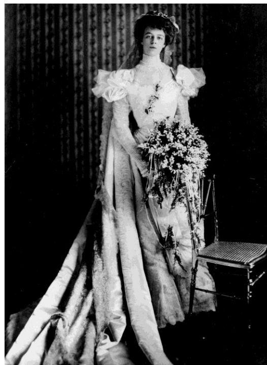
Eleanor Roosevelt on her Wedding Day