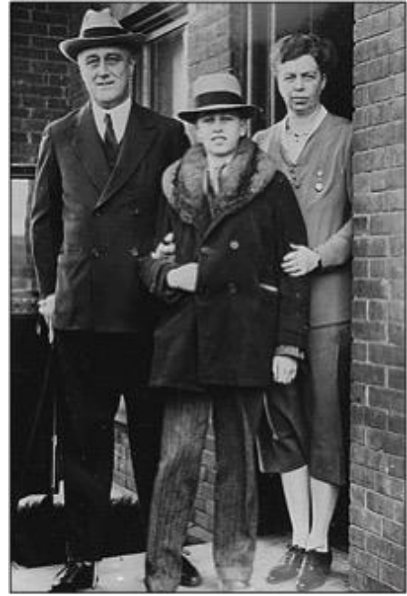
Governor and Mrs. Roosevelt and son John, 1930

In November 1932, Franklin Delano Roosevelt was elected the thirty-second President of the United States. He defeated Herbert Hoover by more than seven million popular votes