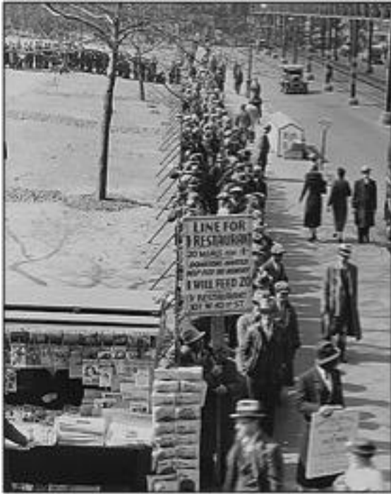
Long line of people waiting to be fed in New York City, 1932.

Share prices fell abruptly late in the month and moved erratically up to October 29 th . The market fell eleven percent, on October 24 th . Some of the richest men in the country intervened to stop the hemorrhage of sell-offs. It abated somewhat, until the following week. On Monday, October 28 th , the Dow slid thirteen points. The next day, known in history as “Black Tuesday,” sixteen million shares were traded. The volume would not be repeated for four decades. The Dow fell twelve percent. Thirty billion dollars evaporated in the span of forty-eight hours. Millions of families lost their life savings. Richard Salsman wrote, “Anyone who bought stocks in mid-1929 and held onto them saw most of his or her adult life pass by before getting back to even.” The market seesawed for the next two years, falling to the lowest level in the twentieth century on July 8 th , 1932. The Dow Jones Industrial Average would not return to its peak of September 3 rd , 1929, until November 23 rd , 1954, a generation later.