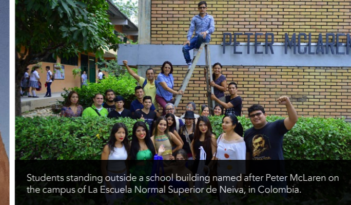
Students standing outside a school building named after Peter McLaren on the campus of La Escuela Normal Superior de Neiva, in Colombia.