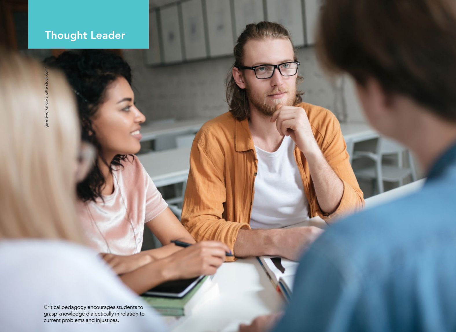
Critical pedagogy encourages students to grasp knowledge dialectically in relation to current problems and injustices.