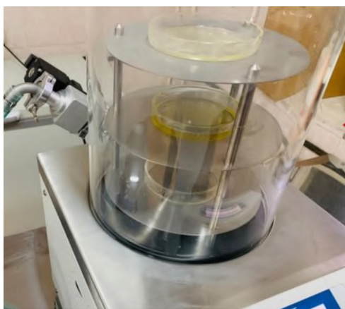
Figure 1 - ALPHA 1-2 LDplus laboratory setup

Studies to determine the technological modes of freeze-drying of honey were carried out on a laboratory unit ALPHA 1-2 LDplus (Figure 1).