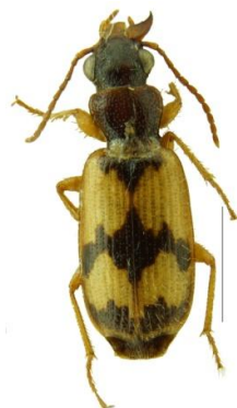
Fig. 2. Trichis iranica , holotype, scale bar = 2mm.

Trichis iranica (figure 2) was briefly described by Mandl (1973) who compared T. iranica only with T. petrovitzi . The colour of the head which is dark in T. iranica and brown in T. petrovitzi . T. iranica differs with T. maculata in the pattern of elytral spots. However, these differences seem to be the intraspecific variations of T. maculata . We follow Morvan's treatments of the synonymy of T. petrovitzi and T. iranica and consider them as subjective synonyms for T. maculata .