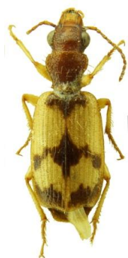
Fig. 1. Trichis petrovitzi , holotype

Mandl (1973) mentioned the differences of Trichis petrovitzi (figure 1) with T. maculata , but provided no collecting data of associate specimens. The heads were black and brown in T. maculata and T. petrovitzi respectively. In the drawings by Klug (1832), the colour of the head is brown. The elytra of T. maculata and T. petrovitzi had black-brown patterns. Either species has a spot near the scutellum, a band just before the apex and also a middle band. The middle band is interrupted by the yellow background colour of elytra in T. maculata , while it is continuous in T. petrovitzi . Bedel (1907) described variations in the pattern of the middle band. Considering some differential characters such as the width of the head and the length of the antennae mentioned by Mandl (1973), T. petrovitzi has a narrower head, and shorter antennae.