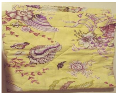
Figure 3 - quilt blanket

In order to analyze the physical and mechanical properties of the quilted blanket, were conducted laboratory studies. The values of significant indicators of the studied samples are presented in table 2.