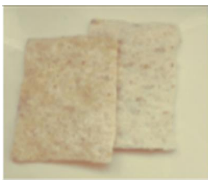
Figure 2 - nonwoven fabric

A quilt was made from the obtained nonwoven material in the recommended ratio of the mixture (No. 3) of wool and cotton fiber waste.