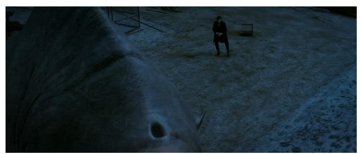
Figure 19 – The camera angle contrasting the Erumpent's size with Newt's size while also exaggerating the size difference through its high-angle perspective.