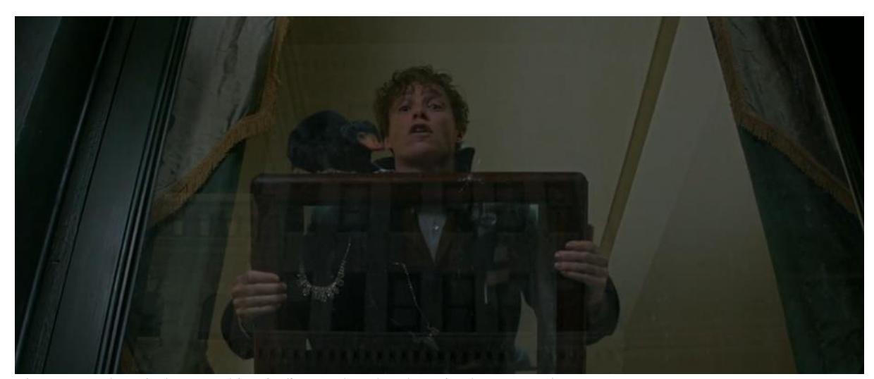
Figure 9 – The window cracking indicates that the chase is about to end.