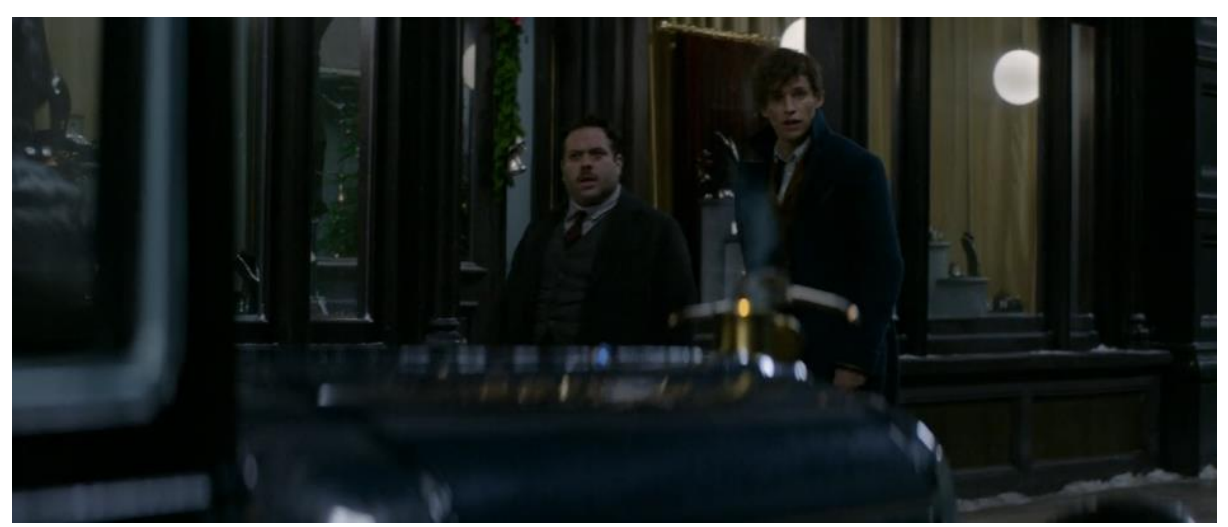
Figure 1 – Newt realizes that the Niffler might be around.