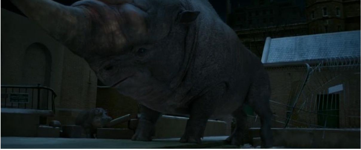
Figure 22 – First image of the entire beast, contrasting its shape and size with a hippo.