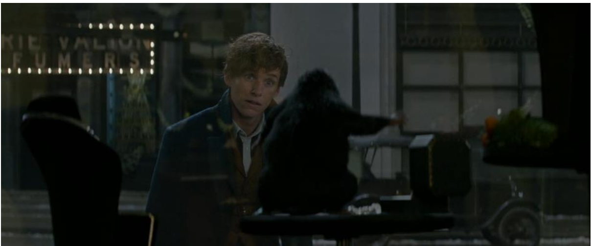
Figure 6 – Newt and the creature making eye contact moments before the chase.