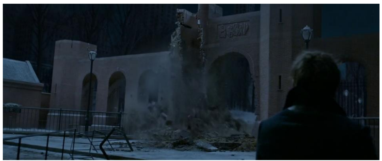
Figure 29 – Framing portraying the destruction described above.

Original Screenplay ), portraying its capability of destroying what is in its way. Typical from a creature of this size and shape.