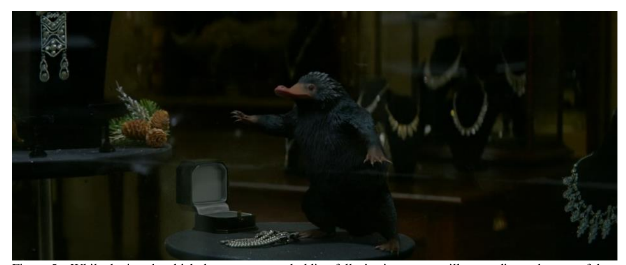
Figure 5 – While the jewels which the creature was holding falls, it tries to stay still pretending to be part of the window shop. At the same time, the beast makes eye contact with Newt.