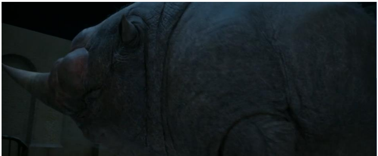
Figure 21 – The camera angle moving in order to show the entire beast.