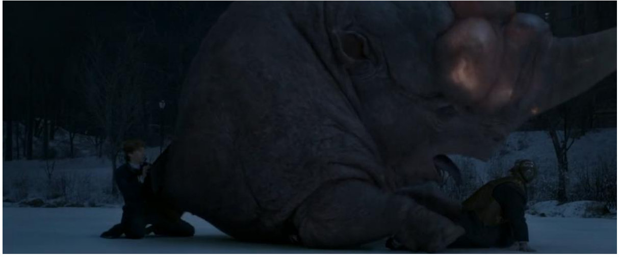
Figure 33 – The Erumpent finally being captured by Newt.