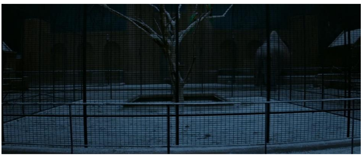
Figure 17 – The Erumpent's first appearance on screen.