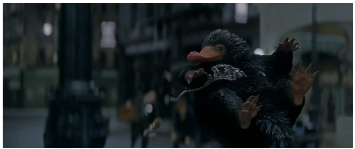
Figure 11 – In slow motion, the Niffler is being pulled by a spell, losing all the jewels that it has taken.