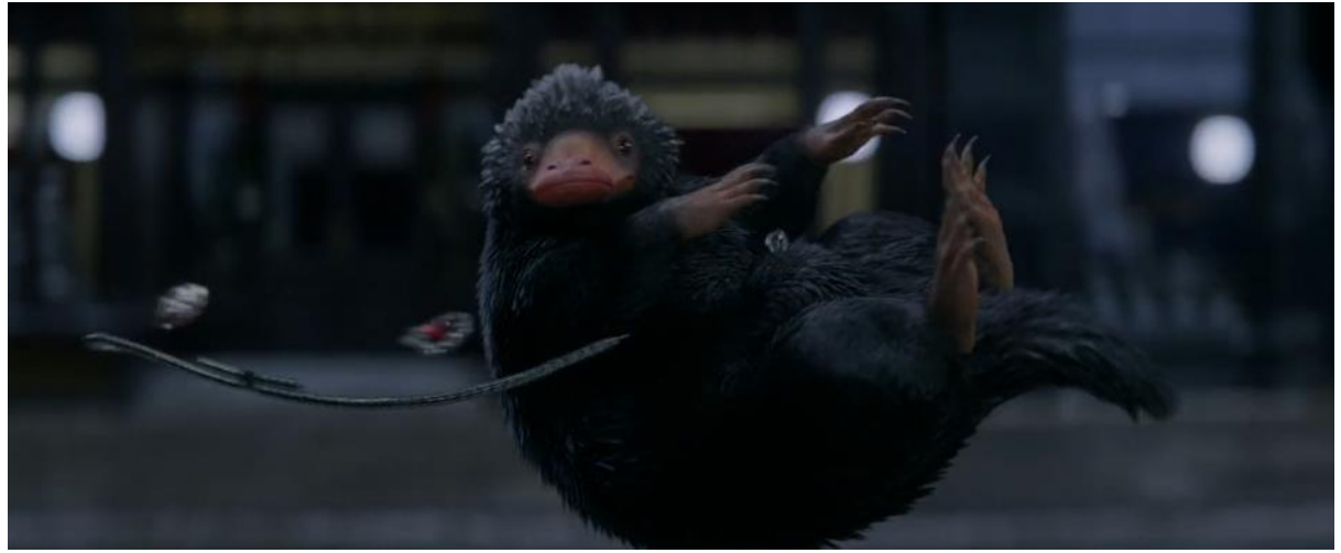
Figure 12 – Following shot still showing the Niffler losing its jewels.