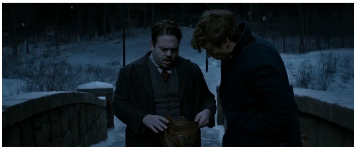
Figure 15 – Newt and Jacob discussing about Jacob's safety before capturing the Erumpent.

Erumpent's figures (Fantastic Beasts and Where to Find Them film):