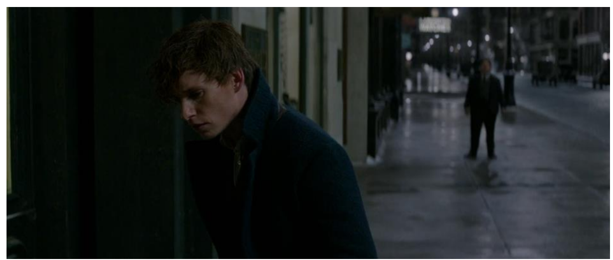
Figure 3 – Newt thinks that he might have seen something suspicious.