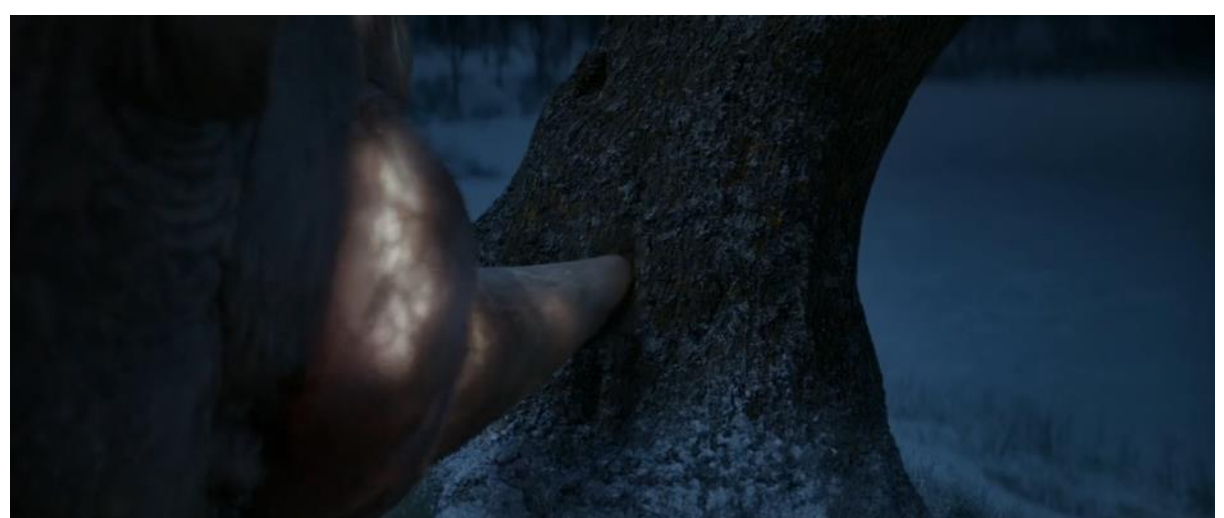
Figure 31 – The portrayal of the Erumpent's "sharp horn" "that makes what it has touched explode" ( FBWFT 16).