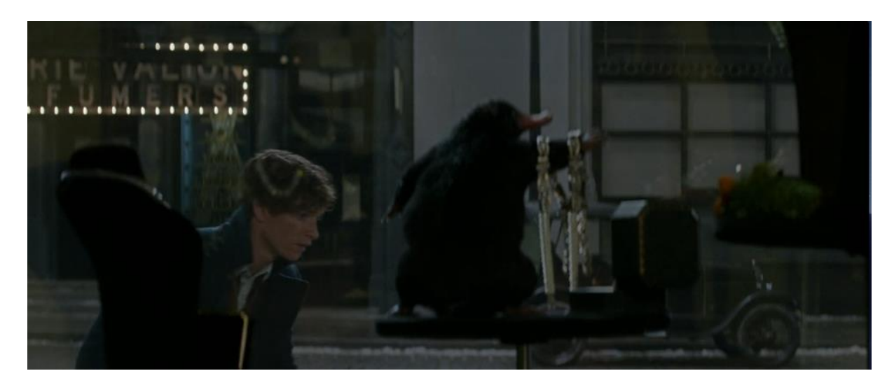
Figure 2 – The camera angle shows the Niffler trying to hide from Newt.