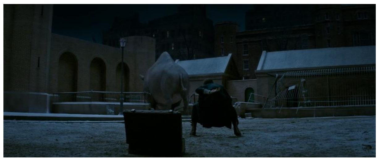
Figure 20 – First clear appearance, from behind, of the Erumpent.