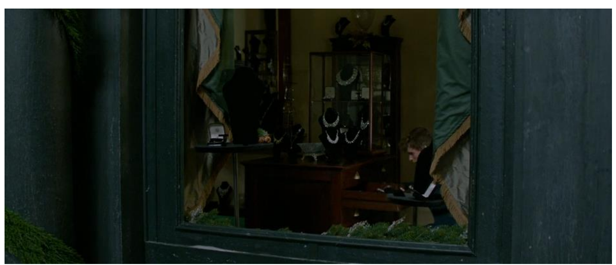
Figure 7- The camera angle showing from a distance Newt chasing the Niffler.