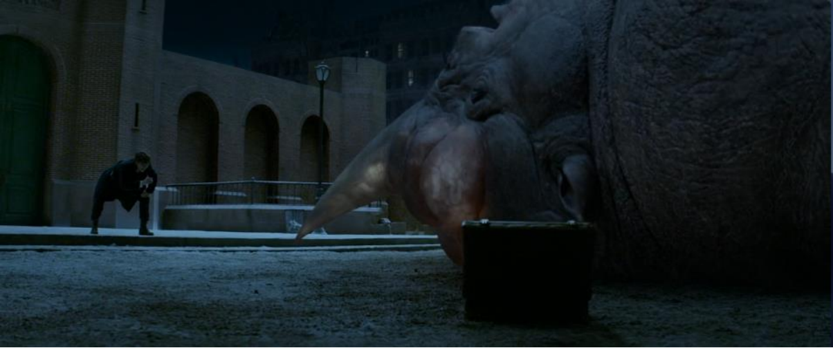
Figure 25 – The Erumpent almost being captured through the mating ritual.