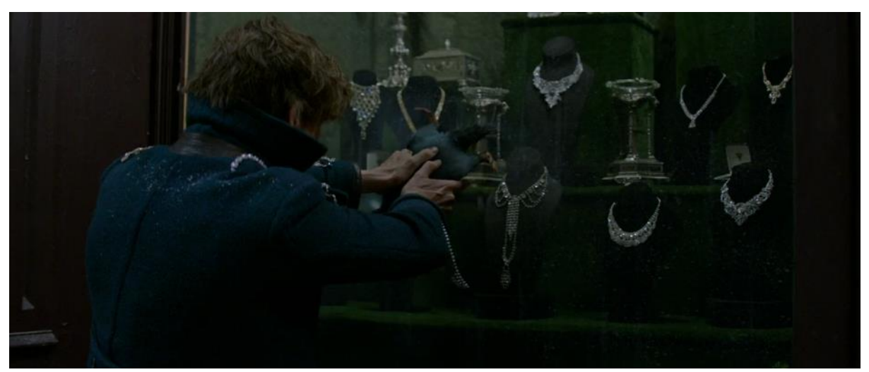
Figure 13 – The Niffler finally being captured by Newt.