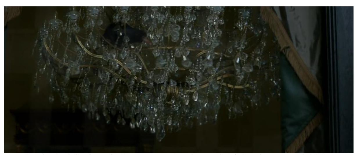
Figure 8 – The chandelier along with figure 7 portrays how the scene is built in order to attract the Niffler's attention.