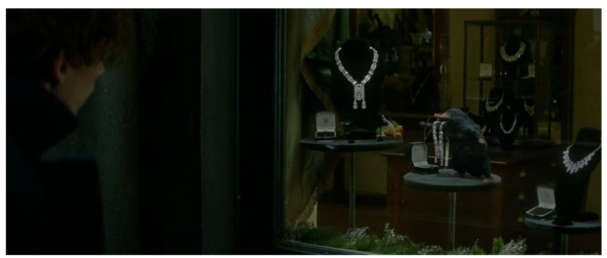
Figure 4 – The Niffler is shown hidden among the jewels, in order to try to avoid being captured.