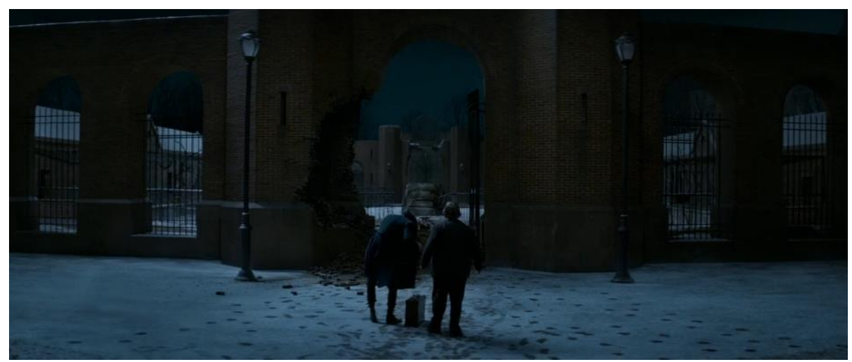
Figure 16 – The entrance of the zoo indicating that the Erumpent might have been there.