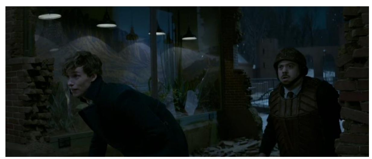
Figure 18 – The scenario of destruction indicates the presence of the Erumpent. Also, Newt realizes that "she is in season and needs to mate" (Scene.57, FBWFT – The Original Screenplay ).