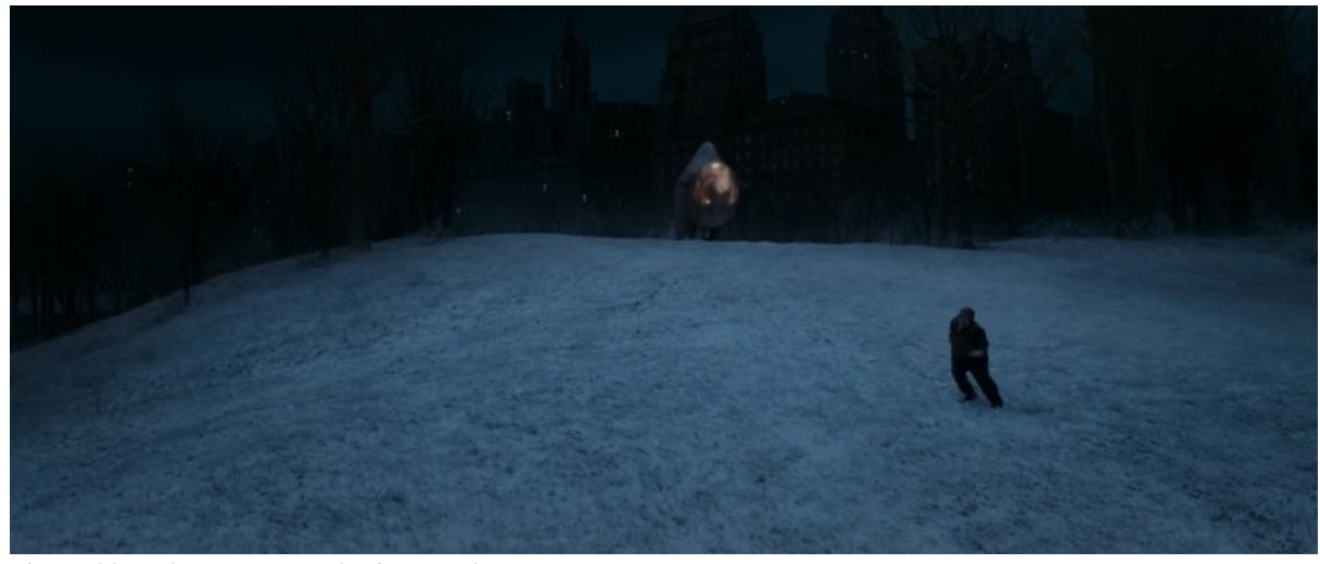
Figure 30 – The Erumpent chasing Jacob.