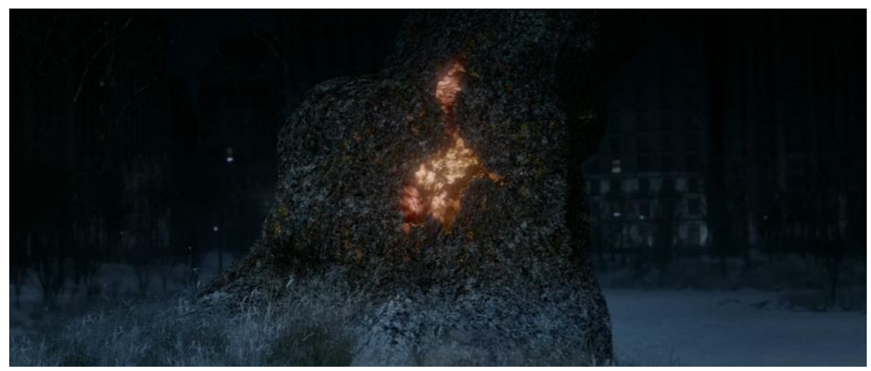
Figure 32 – The tree imploding after being perforated by the Erumpent's horn.