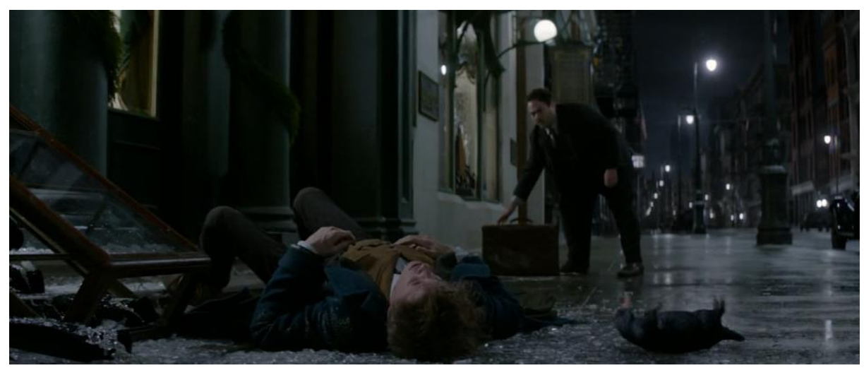
Figure 10 – After breaking the window, the Niffler tries one again to escape from Newt.