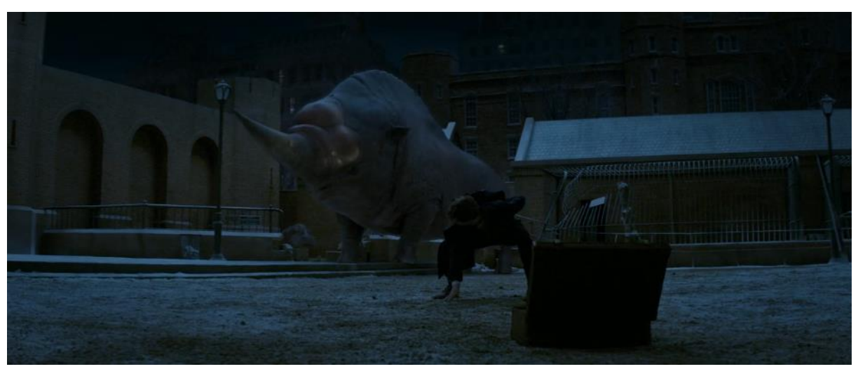
Figure 23 – A little bit more of the entire creature, while Newt starts to perform the mating ritual.