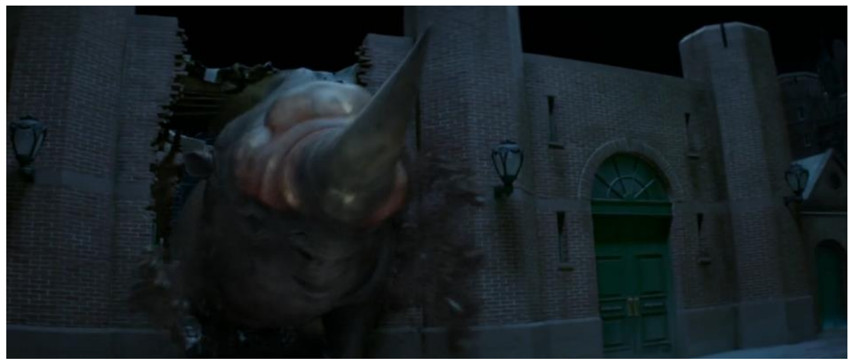
Figure 28 – The Erumpent chasing Jacob after smelling the "Erumpent's musk" (Scene.57, FBWFT – The