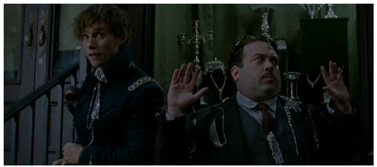
Figure 14 – The Niffler after being captured, staying still with Newt accepting its fate.

After capturing the Niffler, Newt and Jacob resume their hunt after the Erumpent. The scene starts with Newt and Jacob discussing Jacob's safety while helping Newt to capture the Erumpent ( Fantastic Beasts 00:51:57-00:52:07). In order to place the Erumpent in the scene, sound effects such as a loud roar in the distance, and visual indicators such as rubble of the zoo entrance are used prior to its appearance, leading to the expectation of what is to come. The following sequence shows a zoo that looks abandoned, with some destroyed parts in its entrance ( Fantastic Beasts 00:52:32-00:52:33). As the description given by the bestiary of the Erumpent features mentions, such a "large size creature...can be confused with a rhino, because of its shape, weight and size", could indicate that she has gone through the place