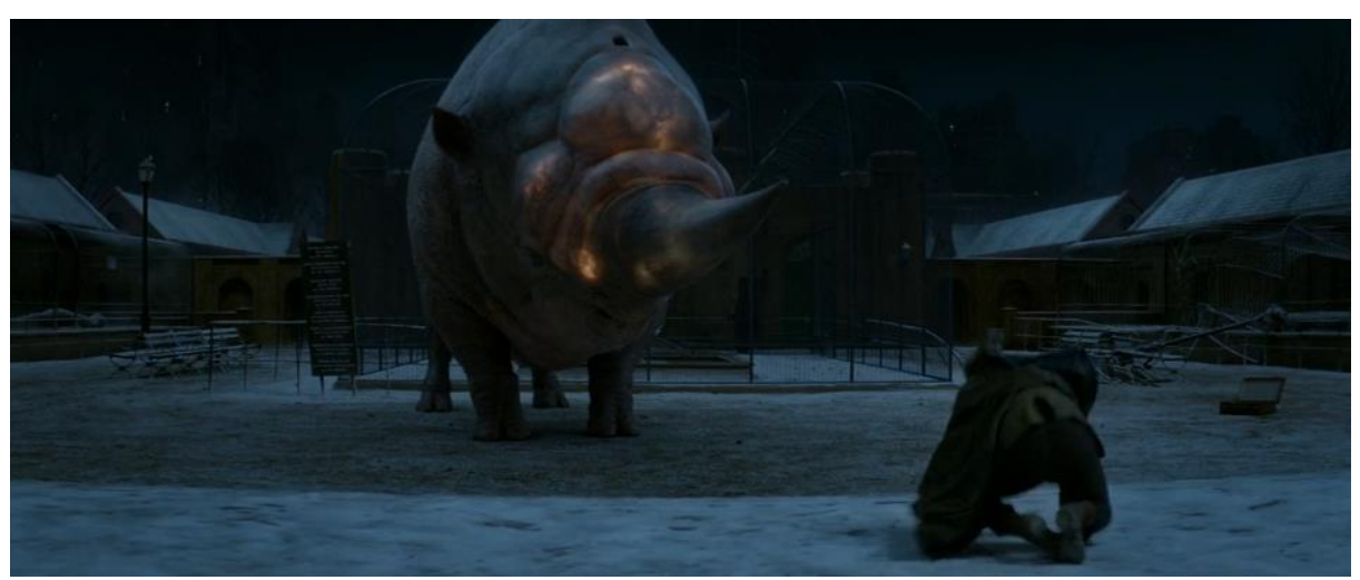
Figure 24 –A clear depiction of the Erumpent's "sharp horn" which has "a fluid that makes what it has touched explode" ( FBWFT 16).