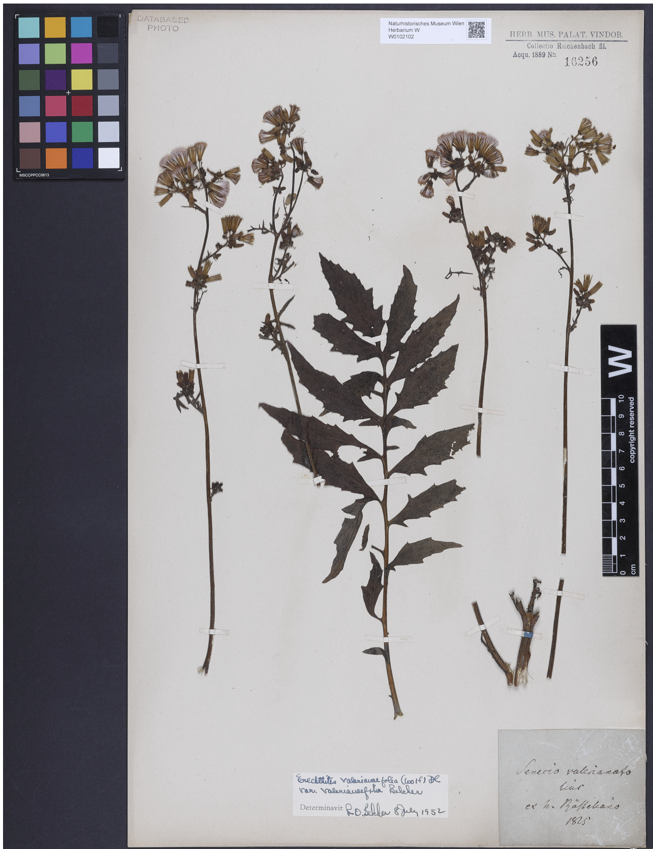
FIGURE 5. Neotype of Erechthites valerianifolia ( Anonymous s.n. , W barcode W0102102!).

Type: —MEXICO. S.d., A.J.A. Bonpland & F.W.H.A. von Humboldt s.n. (lectotype [designated here] P barcode P00320232! [Figure 2]; isolectotype P barcode P00320233!).