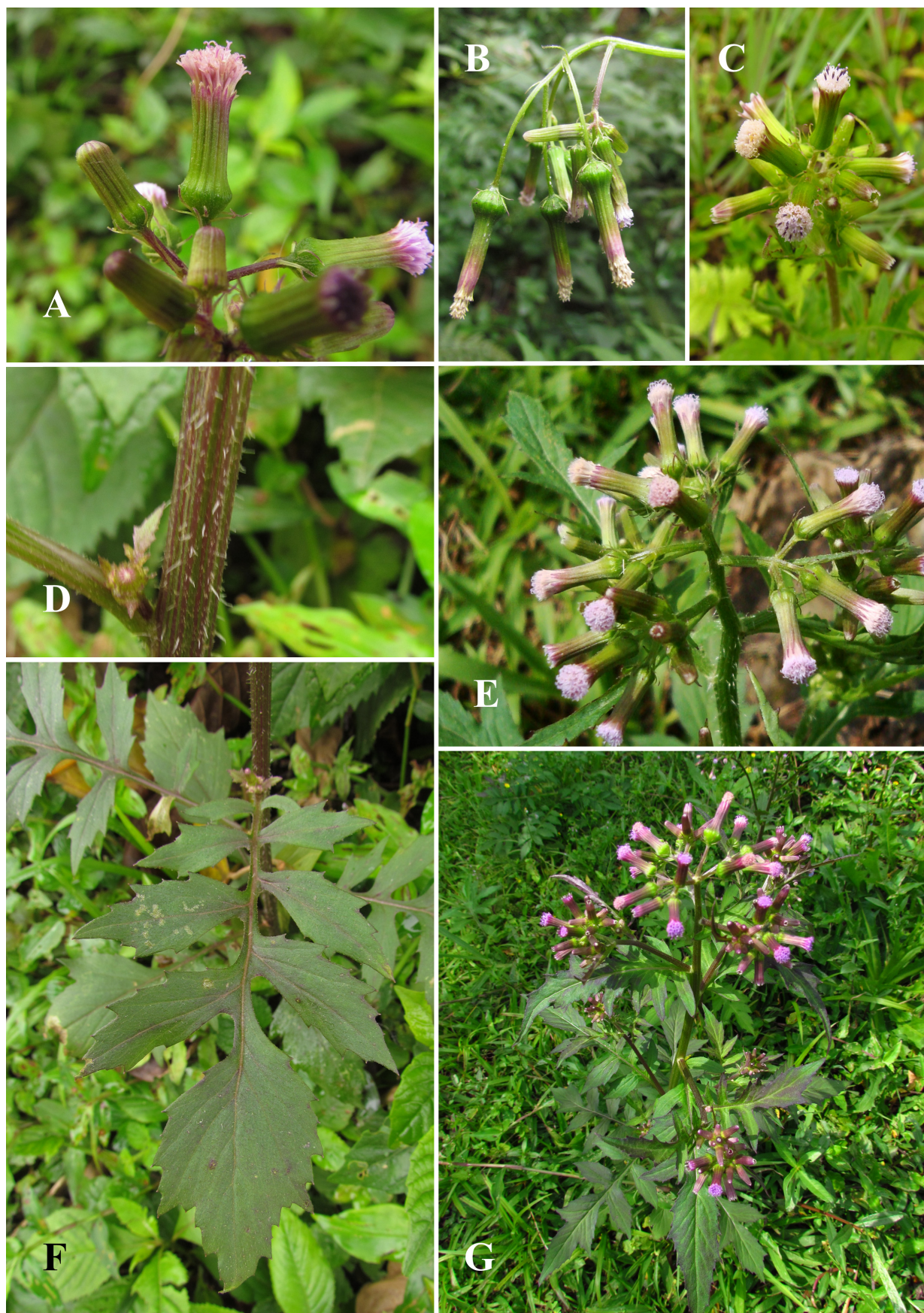
FIGURE 6. Field photographs of Erechites valerianifolius . A, B, C and E. Capitulescence. D. Stem. F. Leaf blade. G. Habit.