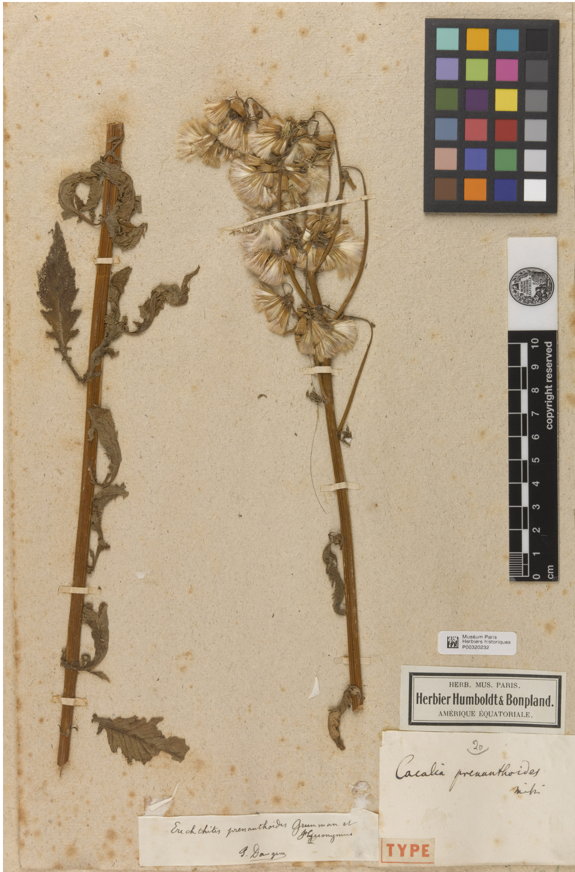
FIGURE 2. Lectotype of Erechthites prenanthoides (A.J.A. Bonpland & F.W.H.A. von Humboldt s.n., P barcode P00320232).