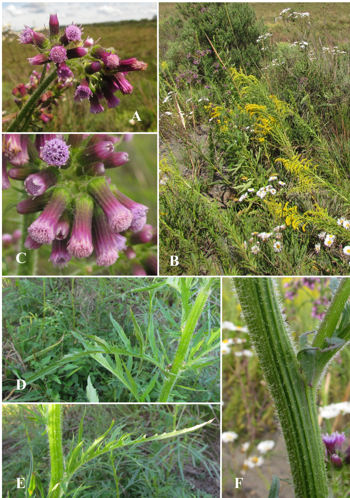
FIGURE 3. Field photographs of Erechites petiolatus . A. Capitulescence. B. Habit. C. Detail of the capitula. D, E. Median leaf blades. F. Stem.