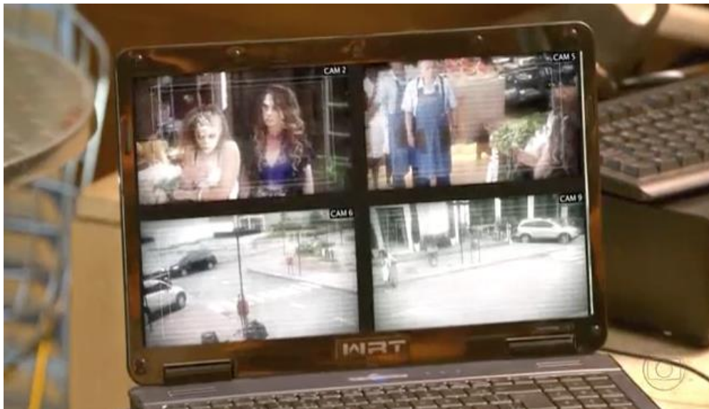
Figure 3.3 The laptop in Messias' Market showing all of the different camera angles

ends, the Empreguetes tell Chayene they're taking Socorro to the police station to file a formal complaint of abuse. When Chayene protests, Rodney tells her, "The security cameras in the store and in the condominium recorded you attacking Socorro!" There is another sequence of cutaways to various cameras in the store, showing that every angle of the store was covered by cameras. Graçinha then slides out from behind the crowd with her cell phone still in her hands, exclaiming, "I filmed everything, you hag. I'm going to post everything online today, 'Chayene attacks domestic worker!'"