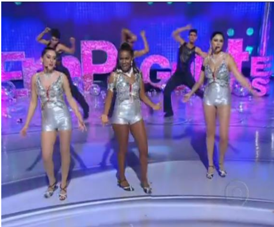
Figure 2.9: Silver costumes hidden underneath the maid outfits