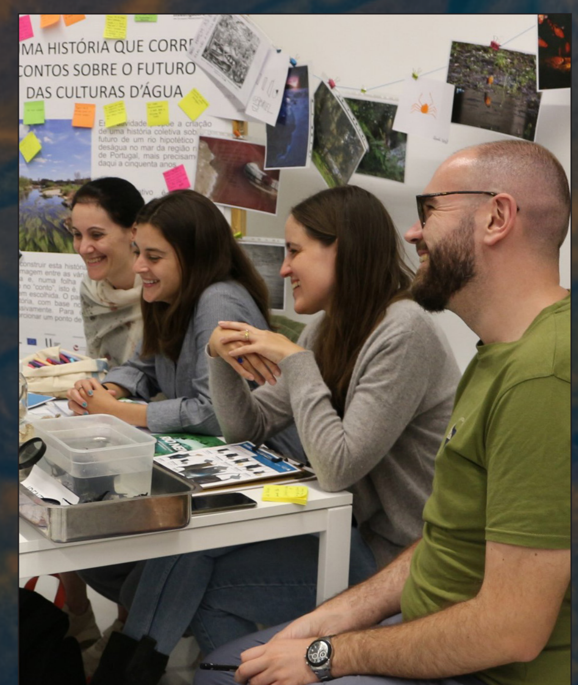
Figure 3: CITCEM researchers at NEI 2022 (Braga)