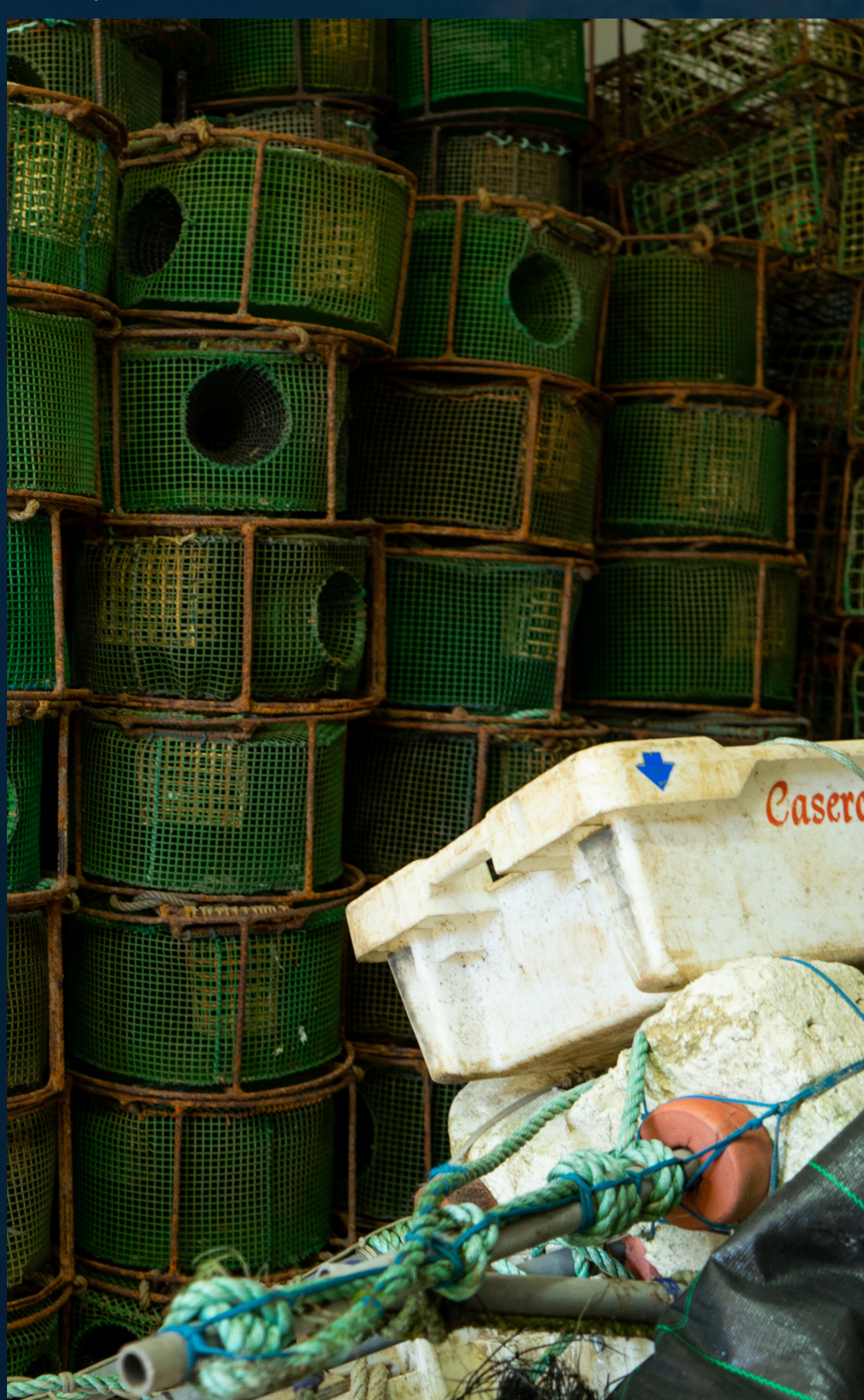
Figure 1: Partner: NGO Rio Neiva (Esposende, Portugal) / Stories from both sides (New European Bauhaus Project, 2021)

The project's focus is geographically situated in the north and northwest of Portugal, which includes the municipalities from Caminha to Ílhavo. Though the coastline is the most obvious target of the work in progress, the more inland waterways will not be forgotten. The co-creative study of the Cultures of Water project is based on a consortium led by the Transdisciplinary Research Center «Culture, Space and Memory» of the Faculty of Arts of the University of Porto and involves more than two dozen partners.