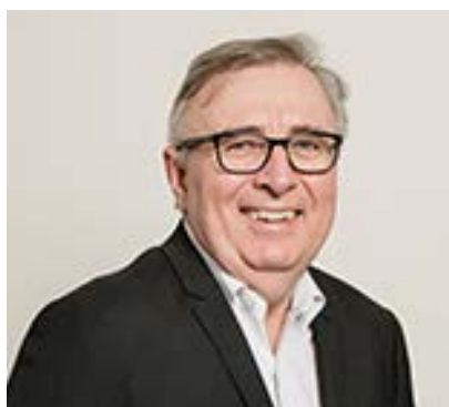
The Hon Michael Lavarch AO Emeritus Professor and former Dean of Law, QUT.