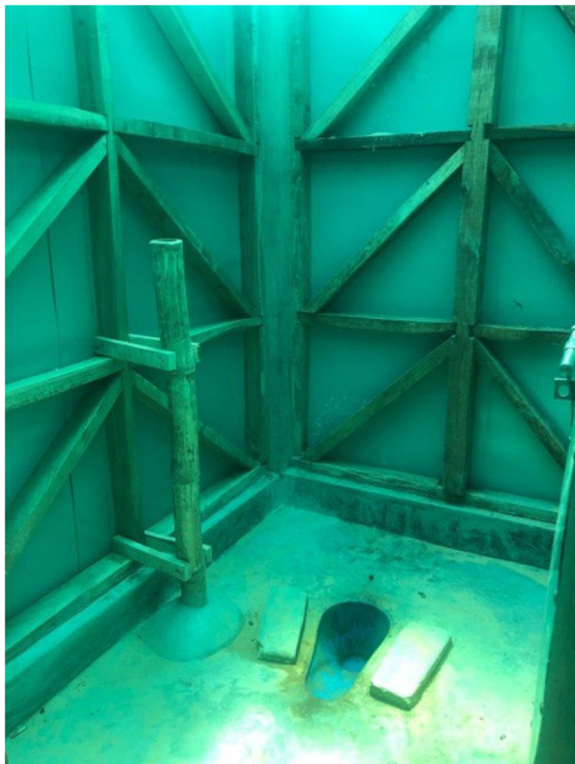
Fig. 1 is an example of a toilet constructed by Oxfam which incorporates specific female-friendly features, including a bamboo pole to support pregnant and elderly users

During the social architecture process, females involved in consultations voiced a series of design concerns. This included fears that men and other community members could potentially peer inside the proposed new facility when girls and women were using it, especially given the hilly camp terrain. One hygiene promotion actor described how this expressed concern translated into a design approach in relation to determining the roof material as “they didn’t want the transparent tin sheets often used because if the light comes through ... others can see in. So it is now a green color.” Beneficiary input was also described as informing the layout design and the introduction of new specific female-friendly elements, such as a bench built inside the bathing room, and a thick bamboo pole next to the latrine slab (see Fig. 1). As one older Rohingya woman explained the rationale for this design recommendation during the FGD: