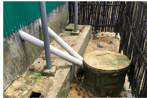
Fig. 3 displays external containers outside the BRCS/DRC female latrines where menstrual waste inserted into the disposal chutes is stored

these new toilets had been installed for less than a year, girls and women expressed initial enthusiasm for the disposal design, viewing it as an acceptable, and even desirable, alternative for disposing of menstrual waste. As another Rohingya woman described, “we like it [the chutes] because we don’t have to bury the cloths anymore. We don’t have to dig a hole and it is not seen by the children ... it is not seen by the males. It is secure for us whenever I want to use it.”