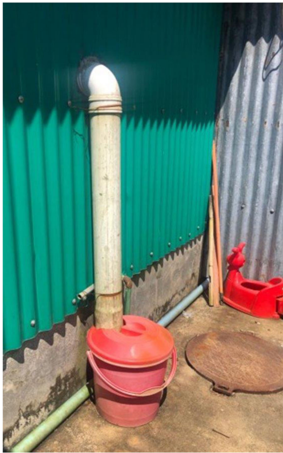
Fig. 4 displays external containers outside the MSF hospital female latrines where menstrual waste inserted into the disposal chutes is stored until onsite incineration

disposal for the patients and created more hygienic solutions for handling menstrual waste in a medical setting.