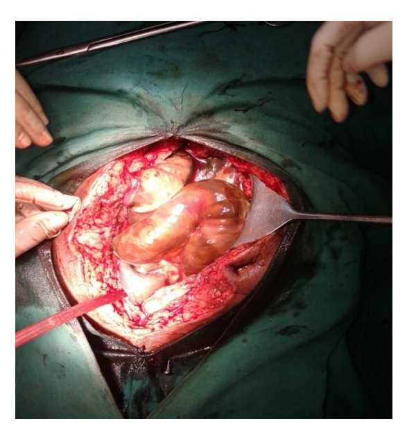
Figure 5: Showing extensive gangrenous changes in small bowel.