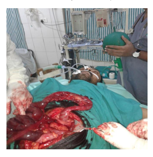
Figure 1: Showing small bowel mesenteric tear.

Second-look laparotomy was performed after 48 hours for definitive procedure. We found gangrene of two-third of jejunum (1½ m) and one-third of ileum (1 m) then resection and anastomosis was done. Patient was recovered well and discharged after 15 days.