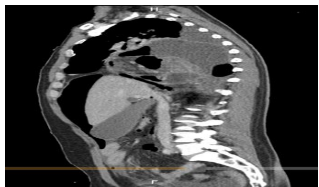
Figure 5: Chest TC scan sagittal section, liquid is observed in mediastinum.