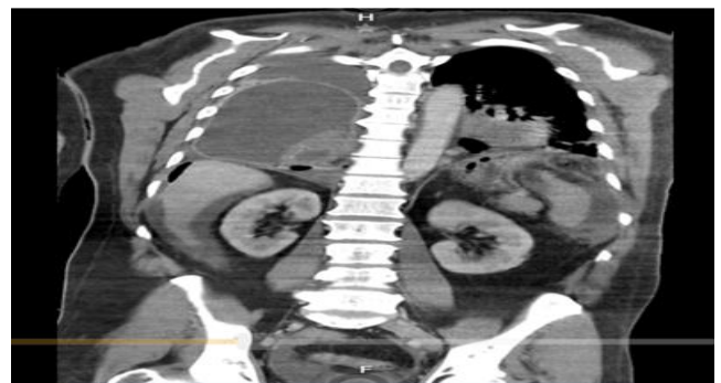
Figure 4: Chest TC, coronal section, stomach in right thorax.