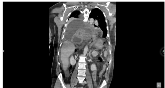
Figure 3: Chest TC, fluid in right thorax.