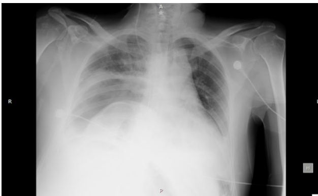
Figure 1: Chest X-ray, gastric bubble is observed in right side.

He was evaluated by the general surgery service who performed emergency surgical management with the finding of an abdomen with purulent and gastrobiliary free abdominal liquid, dilated intestinal loops with lax adhesions, multiple loop-asa abscesses, presence of gastric fundus and gastric antrum, presence of gastric fundus and antrum displaced towards the thorax finding perforated ulcer in the gastric antrum, when reducing 2 liters of liquid from the thorax with serous characteristics and gastric content, right inguinal hernia with viable bowel loops inside. Performing hiatal hernia reduction + primary closure of gastric ulcer. In the postoperative period he was admitted to the intensive care unit, with a torpid evolution and died of lethal arrhythmia 96 hours later.