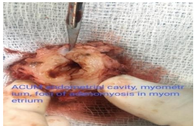
Figure 4: Cut section of mass of endometrial cavity and surrounding myometrium with adenomyotic spots.