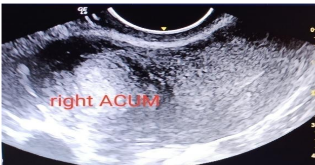
Figure 1: Ultrasound image of central mixed echogenicity in a mass.

Under GA, hysteroscopy confirmed normal uterine cavity, normally appearing bilateral ostia and adequate endometrial cavity in panoramic view. Through laparoscopy, the uterus and other pelvic structures were inspected. The uterus appeared broad, asymmetrical with a bulge in the right lateral wall, close to the round ligament. Both tubes and ovaries were normal. Diluted vasopressin was injected near the mass and a linear incision was made over the anterior surface of the mass with Harmonic scalpel. The mass was dissected out and removed en masse without any damage to the myometrium. The normal endometrial cavity was not entered. The myometrial defect was closed with V-Loc. Specimen retrieved through pouch of Douglas (POD). The vaginal wall closed with 2-0 chromic catgut. On incising the specimen, chocolate coloured fluid of about 10ml flew out due to increased intracystic pressure. Endometrial lining with well-formed cavity and surrounding myometrium with foci of adenomyosis was seen and the specimen was sent for HPE. Postoperative period was uneventful and the patient improved symptomatically. On histopathologic examination-functioning endometrial lining with surrounding myometrium noted.