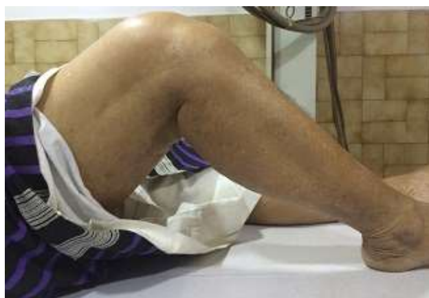
Figure 5: Follow-up at one year showing knee flexion of 70°.