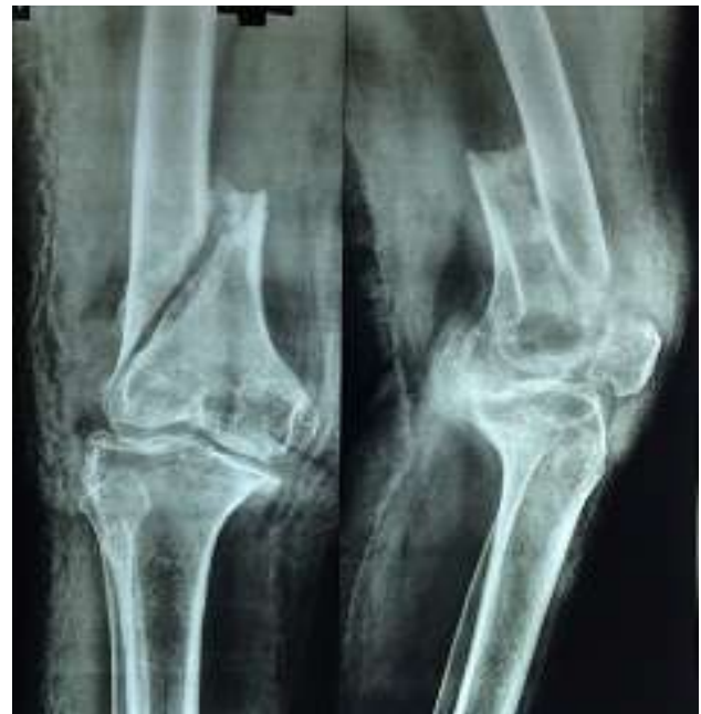
Figure 2: Pre-op X ray showing Type A1 Distal femur non-union with smooth margins.

exposed, intervening soft tissue were cleared and anatomical reduction was done. We used the distal femur locked compression plating with a composite of both locked and cortical/ cancellous screws. Cancellous bone grafting from the iliac crest was harvested and packed at the fracture site. Image intensifier was used in all our cases. After checking for intra-operative stability, wound was closed in layers. Skin was closed over a suction drain. Serial follow-ups were done at 4, 8, 12, 16, 20 and 24 weeks.