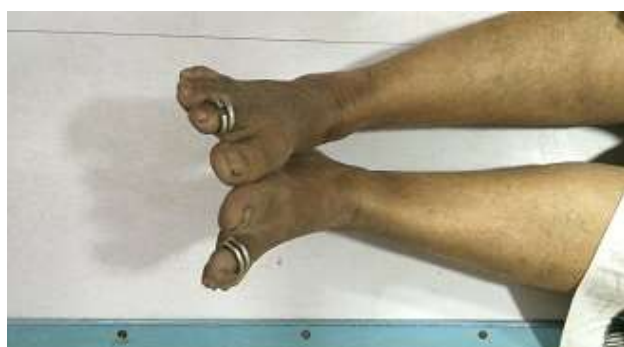
Figure 6: Follow-up at one year with no limb length discrepancy.