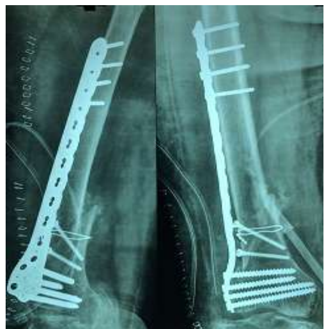
Figure 3: Post-op X ray with good reduction, plate and screws with bone grafting.