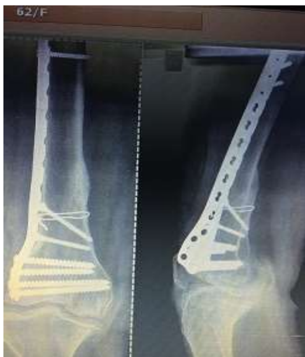
Figure 4: Follow-up X-ray at one year with good healing with implant in situ.