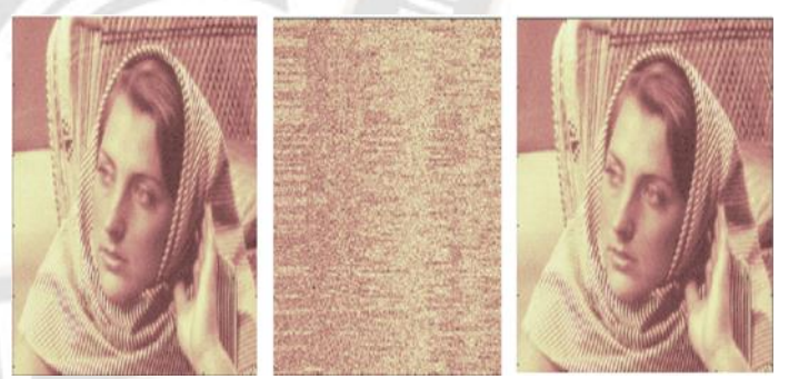
Fig. 1. From left to right, the figure represents the original standard image "Barbra", its encrypted and decrypted results using proposed system

Step 4: Next step is to swap the contents of A_{d2} with V_{d2} and D_{d2} with H_{d2} .