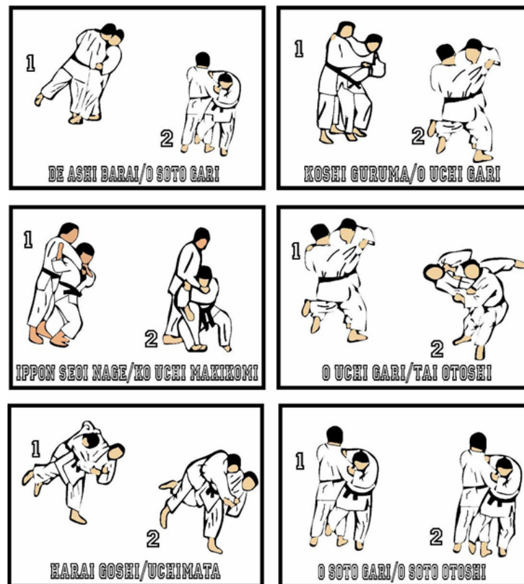
Figure 1 Presents a combination of basic techniques (Renraku Renka Waza) as a training suggestion