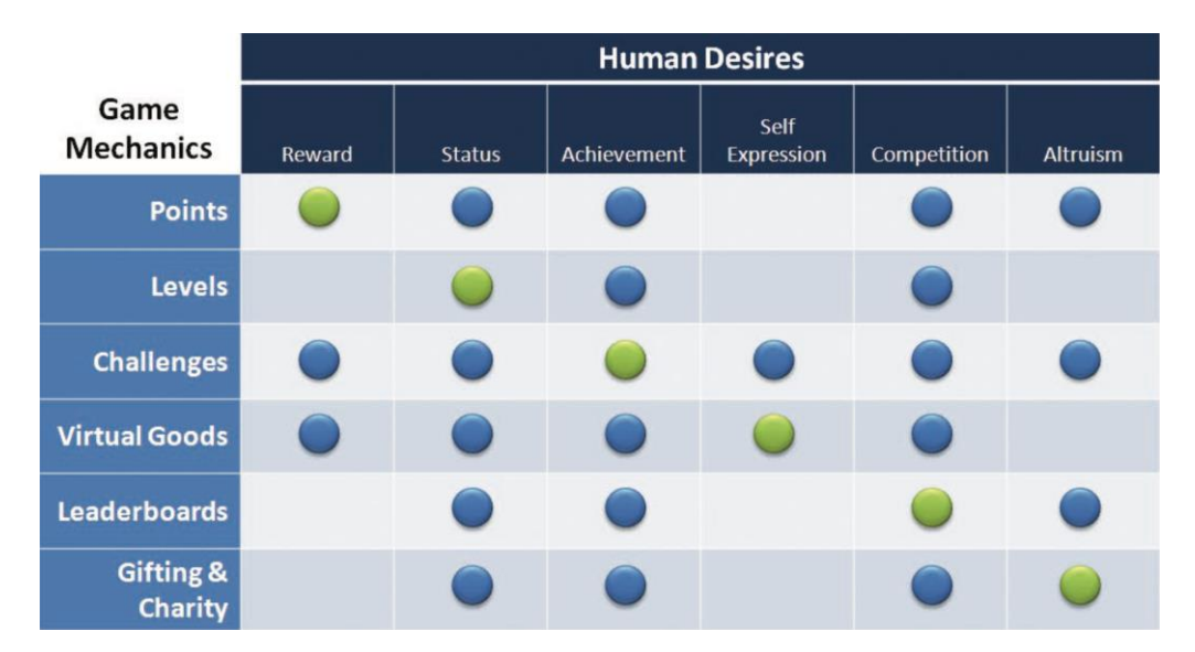
Figure 3. Game Mechanics and Human Desires (Bunchball, 2010: 9).

Bunchball (2010), the pioneer in the area of gamification, has established connections between the different game mechanics and dynamics (see Figure 3). Points, levels, challenges, virtual goods and spaces, leaderboards, gifts, and charity are examples of game mechanics, which refer to the "various actions, behaviors, and control mechanisms that are used to 'gamify' an activity" (BUNCHBALL, 2010: 2). They denote the game rules and rewards, which help to create a compelling and absorbing experience for users by satisfying their human needs and motivating them to perform specific actions.