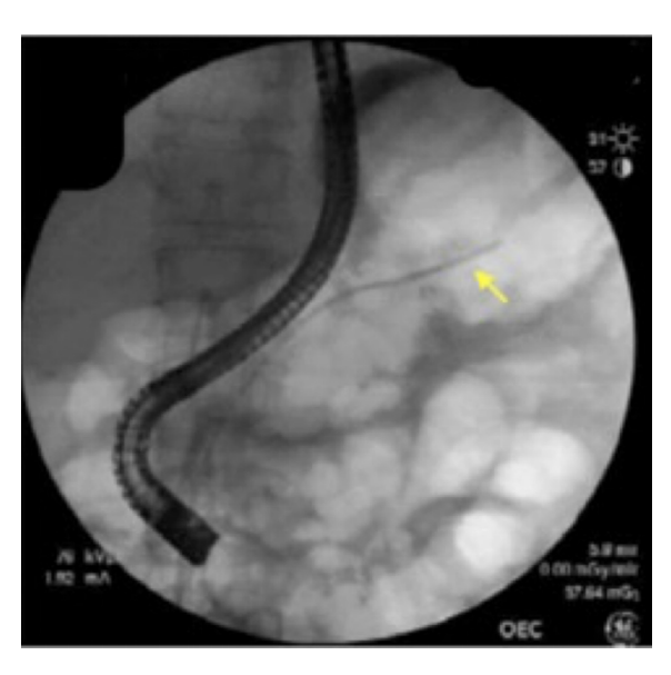
Fig. 1. Fluoroscopy from ERCP prior to admission showing placement of the PD stent (yellow arrow).

long PD stent with one end terminating in the duodenum and the other end traversing the splenic parenchyma (Fig. 2). There was a new organized fluid collection in the left subdiaphragmatic space and left retroperitoneum. The position of the shorter stent was unchanged. Percutaneous drainage of the peri-splenic fluid collection revealed thick pus and grew E.coli on culture. Surgery and gastroenterology were consulted, and a decision was made to proceed with non-surgical, endoscopic stent retrieval.