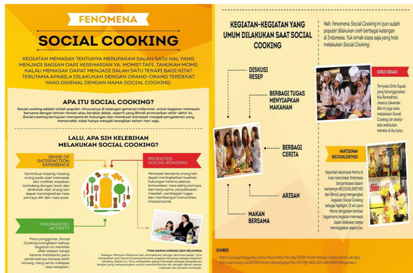
Figure 1.2 The Social Cooking Phenomenon