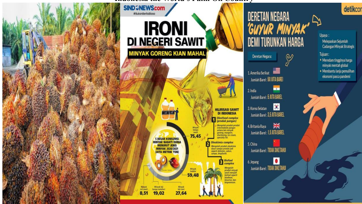
Figure 1.1 Indonesia the World's Palm Oil Country