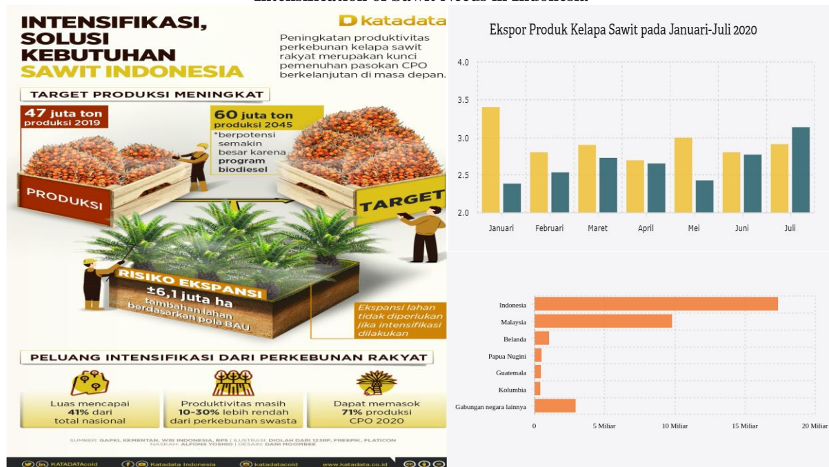
Figure 1.8 Intensification of Sawit Needs in Indonesia