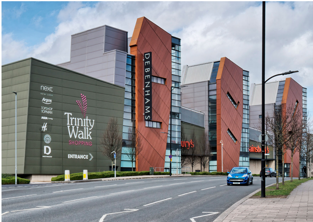
Figure 5. The ‘Emerald Ring’/ inner ring road with Trinity Walk: (Author, March 2022). The road in the foreground is part of the city centre ring and was criticized in the Koetter Kim reports for severing pedestrian movement. The ‘Debenhams’ store is closed and vacant.

the so-called ‘Westgate Run’. The traditional name of Wakefield as the ‘Merrie City’ is likewise associated with drinking and partying. The name itself persists in social media and has also been used in tourist promotion. However, the same reputation of the city centre as a ‘wet led retail centre’, namely a retail centre based on drink, has hindered efforts to attract a new cinema and family-run restaurants and, in the words of the minutes of the local Task Force, had ‘in the past’ ‘tarnished the city’. 89