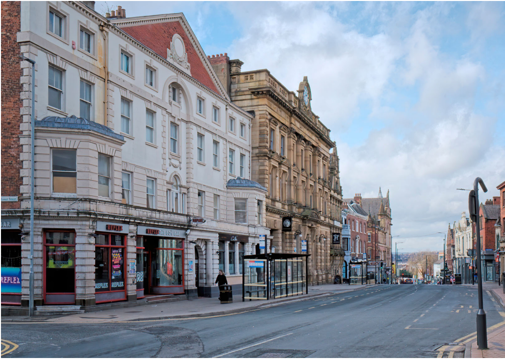
Figure 6. The upper end of Westgate (Author, March 2022). The white building on the left, Westgate Studios, offers space for working artists. Other artists' spaces are available in an annexe to Westgate Studio and in the Art House, both in side streets. Restaurants, take-aways, clubs and drinking establishments occupy the ground floor of all the buildings in view.

and are developing another, positive narrative. 91 For the moment, however, the city centre economy remains relatively 'weak' as classified by the Centre for Cities. 92