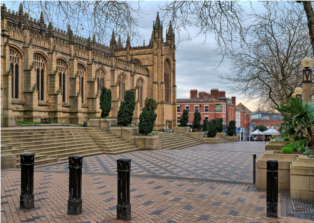
Figure 3. The Cathedral Precinct: (Author, March 2022). The paved area and stone terraces are the product of the remodelling exercise by Jaray. In February of each year, the precinct hosts a food festival, celebrating the local delicacy of winter rhubarb.

publicly funded redevelopment project that would eventually lead to the Hepworth. This latter drew on contributions from the National Lottery, the Arts Council and the local Council. A fourth proposal did not go ahead. This was for mixed-use housing and green space to replace the Ings Road retail park, with the opening of a culverted stream. Instead, most of the retail park units were subject to privately funded rehabilitation, completed in 2017. 75 As is apparent from this example, implementation of the Area Plan depended crucially on the availability of private funding.