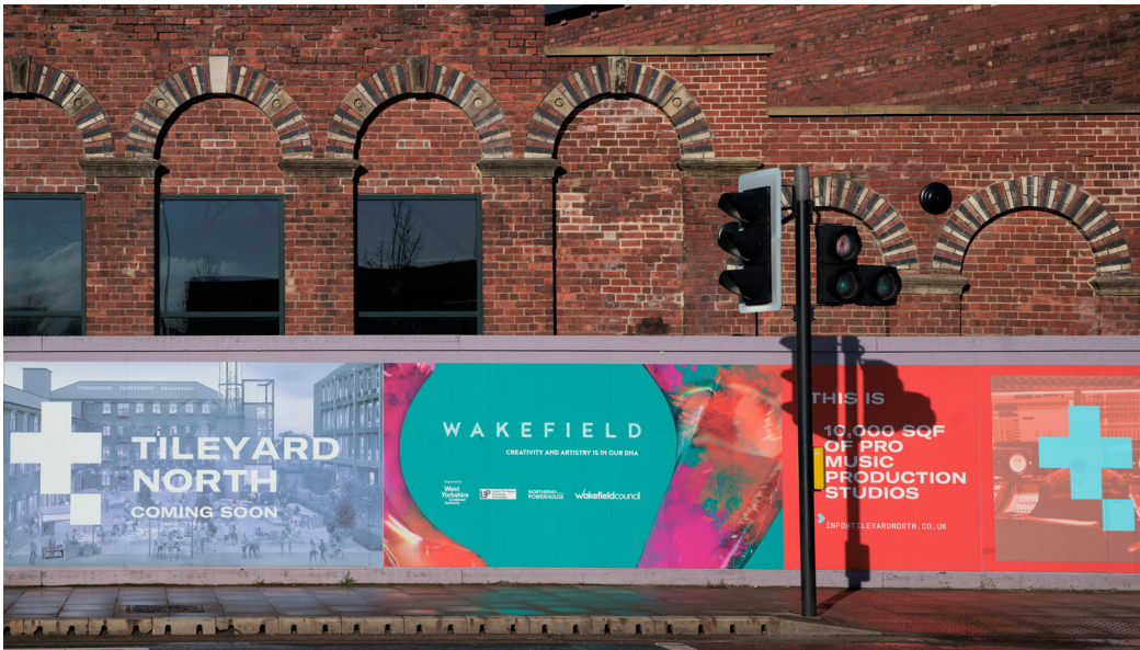
Figure 7. The Creative Wakefield brand ( Author, March 2022 ). The poster is fixed to a wooden barrier that surrounds the ongoing conversion of a complex of semi-derelict former woollen mills into the Tileyard North creative industries hub. Tileyard North summarizes in a single project how culture-led regeneration now seeks to combine production with visitor attractions.

placeless and abstract (Figure 7). The brand comprises a set of standardized colour palettes, fonts and illustrations, and a slogan ‘dare to be different’ that is rarely used. 101