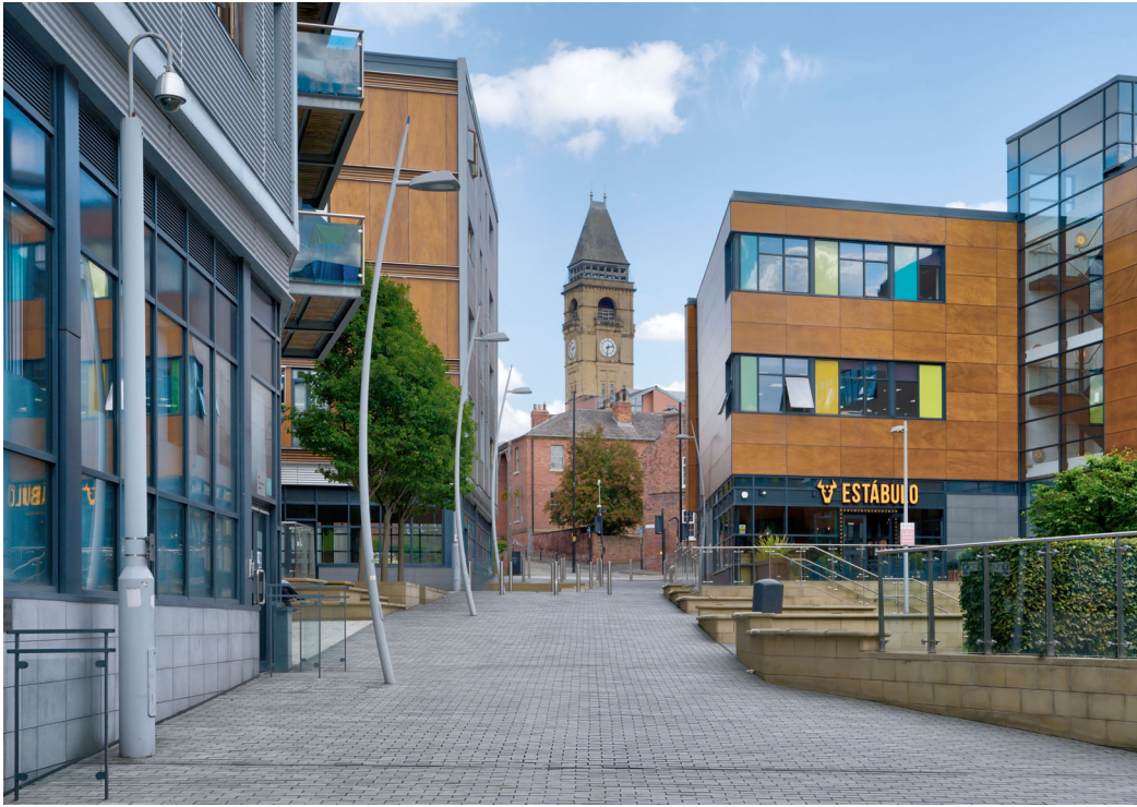
Figure 4. The Merchant Gate office project (Author, August 2022) The influence of Urban Renaissance place-making is apparent in the inclusion of the small area of open space and the direction of the footpath so that it enables a view of the Town Hall tower. The offices, though well located and of good quality, have proved difficult to let.

2014, and this suggested that non-local visitors were deterred by the absence of other attractions or amenities in the immediate vicinity. 85 Getting to Wakefield just to see the Hepworth was not worth the effort, especially given the distance of the gallery from city centre shops and restaurants.