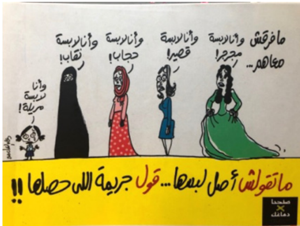
Figure 8. A cartoon by Doaa Eladl on a leaflet from HarassMap headquarters (2014)

The results of the anti-harassment movement's efforts had contributed to legislating the new law against SH – days before interim Prime Minister Adly Mansour handed over power to El-Sisi in 2014 (Kirolos, 2016). These results led to the recognition of SH at the legal level. Thus, the effect and results of the interviewees' visibility was apparent, through which the interviewees overcame, to a moderate degree, their marginalisation after the triumph of the recognition of SH. With a moderate degree, I mean even though they received recognition, in practice, SH still remained a problem to be tackled in the public sphere.