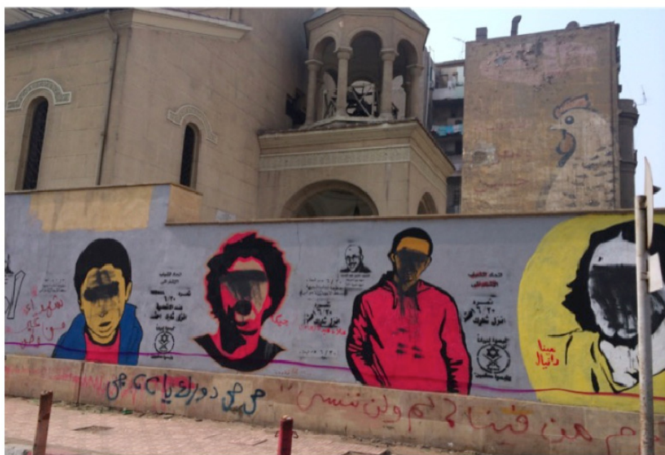
Figure 15. Author's own photograph (2014)

From my observation, I saw a lot of graffiti on the walls of a church in downtown Cairo in 2014. Some people intentionally defaced this graffiti. I think that this defacing was not done by a bunch of messy and inconsiderate people because they only destroyed the eyes of those portrayed. There was a message that it was El-Sisi's turn, hastily drawn but left alone. There was an announcement for apartments and houses. A few other things I could not really make out, but the layers turned the wall into a space of contestation between different political actors. The graffiti depicted the martyrs of the Maspero Massacre in October 2011, including Mina Danial, a Coptic Christian activist who was killed in the Maspero protests. This situation suggests that they would hide the identities of these portrays on the walls (Fig. 15).