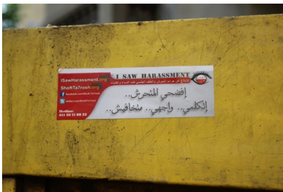
Figure 7. ISH (2018)

On the other hand, one of ISH’s main strategies was to encourage women not to remain silent. For example, the leaflets the initiative distributed on the streets (Fig. 7) read in Arabic, ‘Expose the harasser ... Speak out ... Confront ... Do not be afraid’.