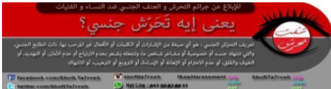
Figure 3. ISH (2018)

Figure 3 shows ISH’s widely distributed leaflet. It illustrates how ISH took its activism to the streets to raise public awareness about SH and how SH constitutes a significant threat to society, not just to women. In the image, ‘What is SH?’ is written in Arabic (own translation).