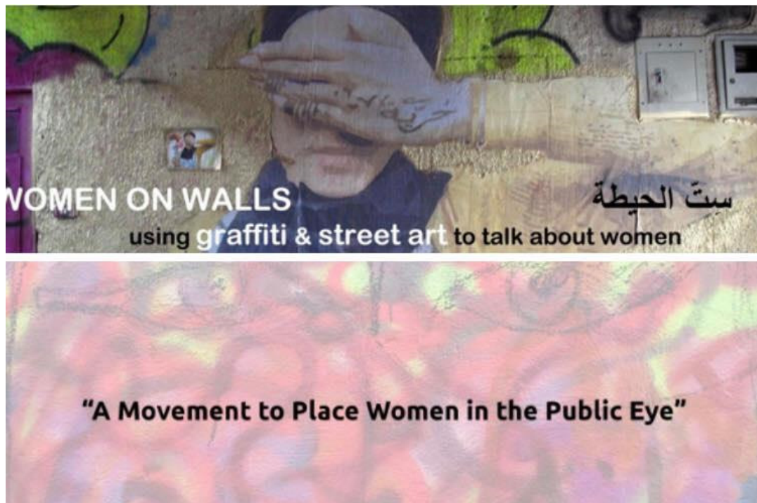
Figure 9. WOW (2018)

WOW spearheaded many campaigns, including the project in Cairo with 30 artists and other campaigns in MENA countries that included 60 streets. WOW was funded by CKU (The Danish Centre for Culture and Development). WOW worked with many local NGOs, such as feminist groups like Nazra, to advise WOW on how they would represent women's issues through graffiti.