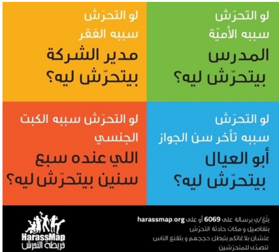
Figure 4. HarassMap (2018)

An emerging pattern in the two initiatives and other initiatives I visited, for example, the Bassma initiative, was that men directed these new forms of action-oriented activism groups and many men volunteers participated. This interesting information suggests that SH was a concern for women and men who were tirelessly combating SH. This pattern corresponds with the aforementioned reports of many men who supported women in 6AYM, OPPs, and later in the graffiti group, showing a feminist consciousness but without a feminist organisation. Indeed, Nevine Ebeid (NWF) asserts that,