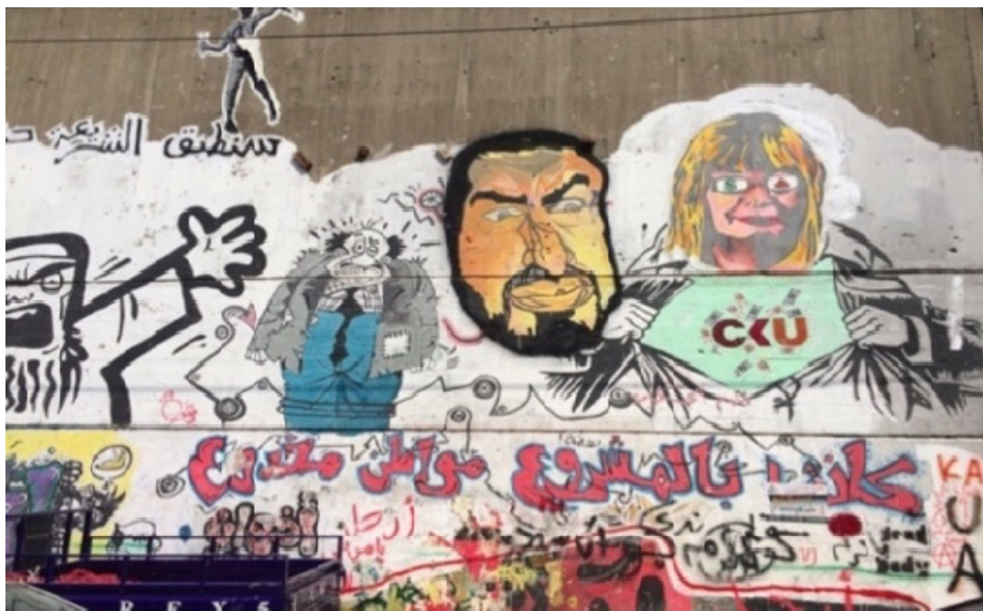
Figure 16.

Thus, removing graffiti might be intended to separate some of the perceived political content in the public space from integration into the public sphere by marginalising certain issues such as feminine figures in a public space; it represented the dominant cultural discourse that the Islamists and the state had in their struggle against Western cultural hegemony.