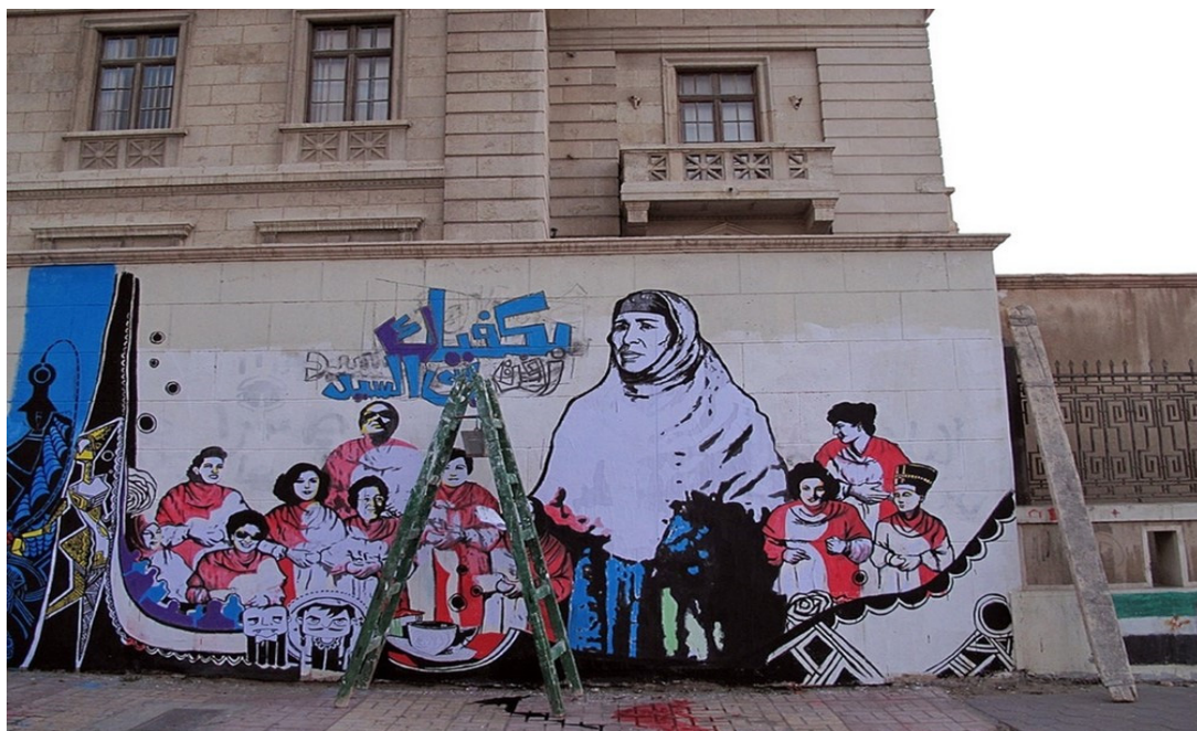
Figure 10. WOW (2018)

I saw a very famous mural from WOW in Alexandria that depicted Amina, the fictional character from the novels of the Cairo Trilogy by Naguib Mahfouz. In this graffiti, Amina was seen with her children, who are an example of the Egyptian people, and she said ' si al-sayyid ' ('enough is enough') to her bossy husband (Fig. 10).