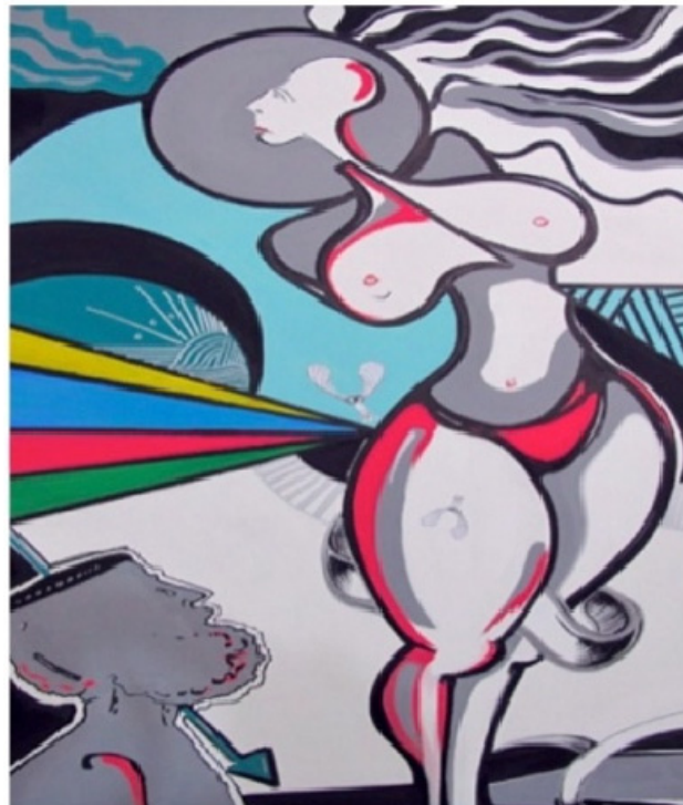
Figure 11. WOW (2015b)

First, disclosing the sensual private feminine items questions sexuality in what society perceives as private. In her graffiti, Nour (WOW, 2015b) symbolically depicted a naked female body that people perceive as taboo to open the space for public discussion about sexuality. She called her graffiti 'There is no shame' (Figs. 11–12). She noticed a man looking at her lustfully and intrusively, as if she were an object or something that would give pleasure.