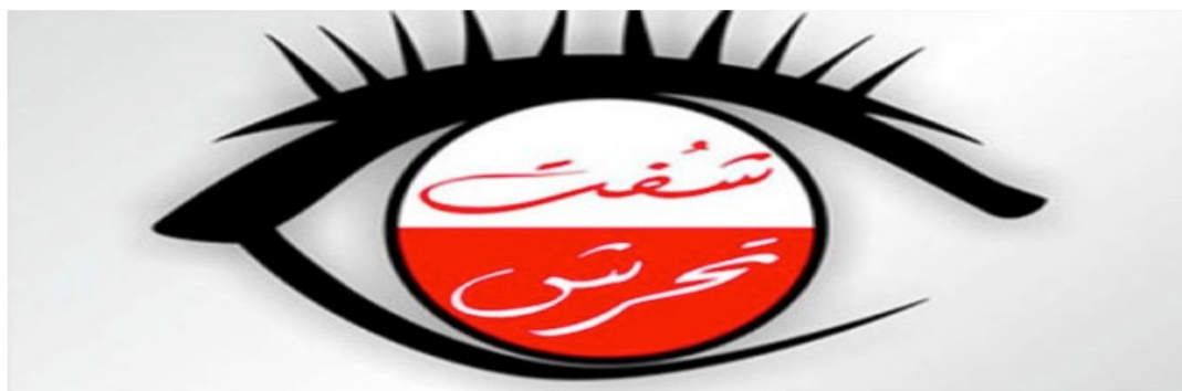
Figure 5. ISH logo from a leaflet brought from the ISH headquarters in 2014

In this regard, ISH used semantic symbols to encourage people to pay attention to harassers instead of women's bodies. For example, ISH's logo is a large eye (with the Arabic inscription ISH) (Fig. 5), which symbolises surveillance not by the regime or police or other official organisations but by ordinary people who observe the regular harassment of women. Volunteers in the teams wore this logo on their T-shirts, and it was also printed on the leaflet.