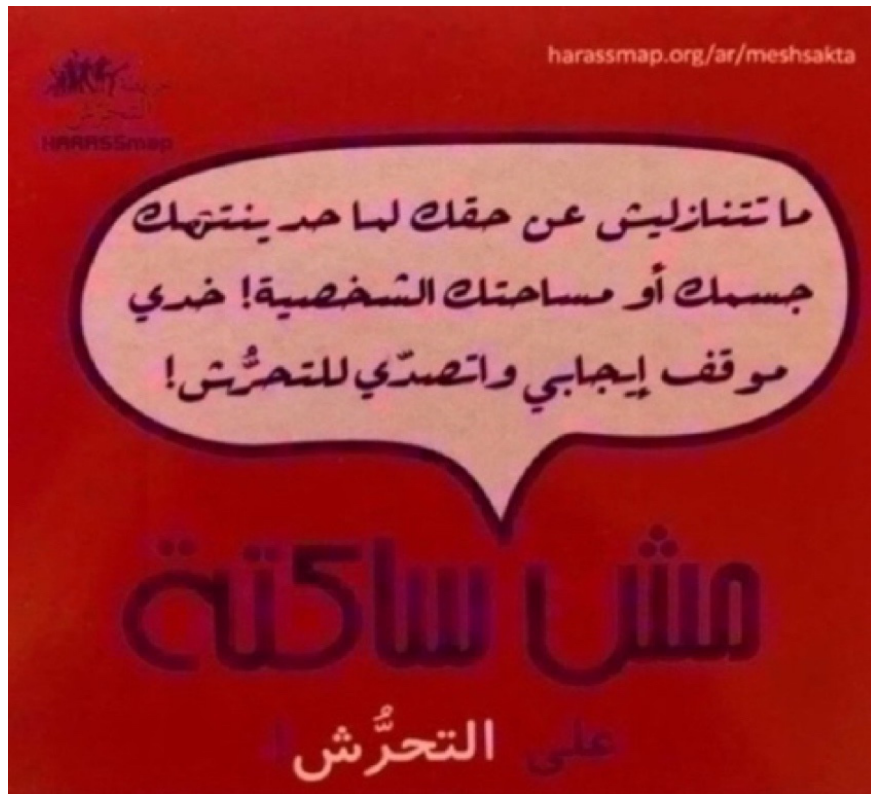
Figure 1. The leaflet brought from HarassMap headquarter in 2014

ISH also talked to people, and tried to change their mindset about women's bodies. During the political upheaval and demonstrations, ISH's press releases portrayed SH as terrorism against women's bodies: 'The demonstrations that took place from 28 June to 30 July against Morsi and MB in Egypt. Do not use the bodies of women and girls to kill the revolution' (ISH, 2017, own translation).