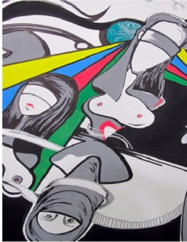
Figure 12. WOW (2015b)

In this way, a woman's body could be recognised in its sincerity and dignity. The graffiti gained greater public attention when it attempted to redefine the notion of sexuality in what was perceived as a woman's private body to make it public. The attempt challenged the Islamists and state secular discourse that sought to control women's bodies by reducing them to honour culture (Pratt, 2020).