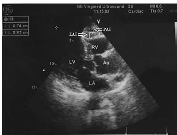
Figure 1. Measurement of epicardial adipose tissue (EAT) thickness; PAT — pericardial adipose tissue; Ao — aorta; LA — left atrium; LV — left ventricle; RV — right ventricle

Baseline characteristics including age, sex, past medical history, and concomitant medications were recorded. An-