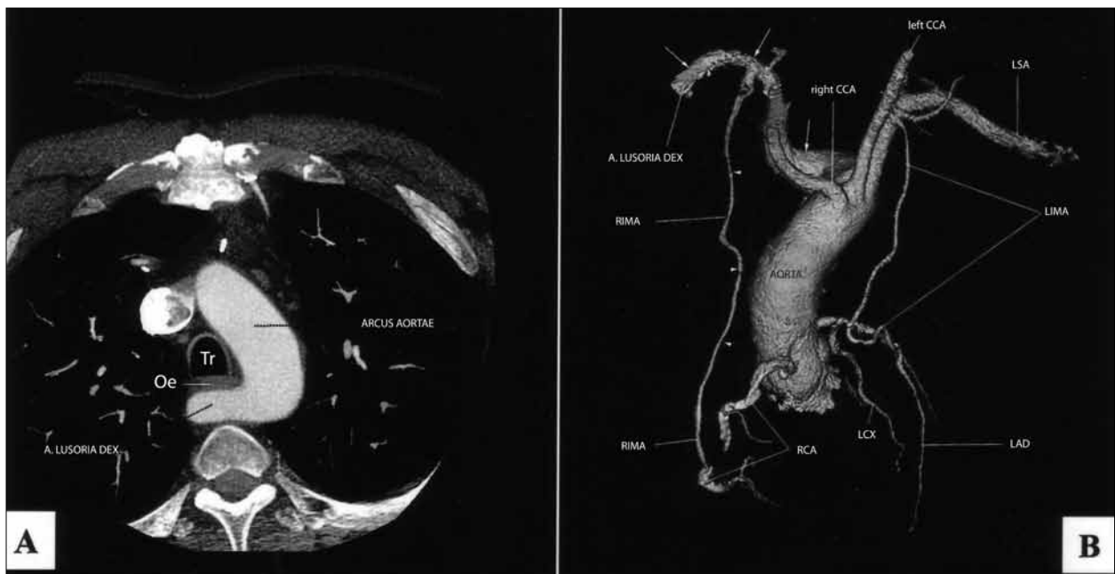
Figure 3. CT axial view (panel A) showing arteria lusoria dextra originating from the right wall of the posterior part of left aortic arch and runs to the right and behind the esophagus and trachea. 64-MDCT angiography, anterior-superior view (panel B) precisely showing arteria lusoria dextra (white arrows) arising from the right wall of the left aortic arch, just below the ostium of the left subclavian artery, runs upwards and to the right. It also shows RIMA (arrow head) which originates from the inferior wall of the arteria lusoria dextra and runs downward to the distal segment of RCA.

RIMA – right internal mammary artery; RCA – right coronary artery; PDA – posterior descending artery; PL – posterolateral artery