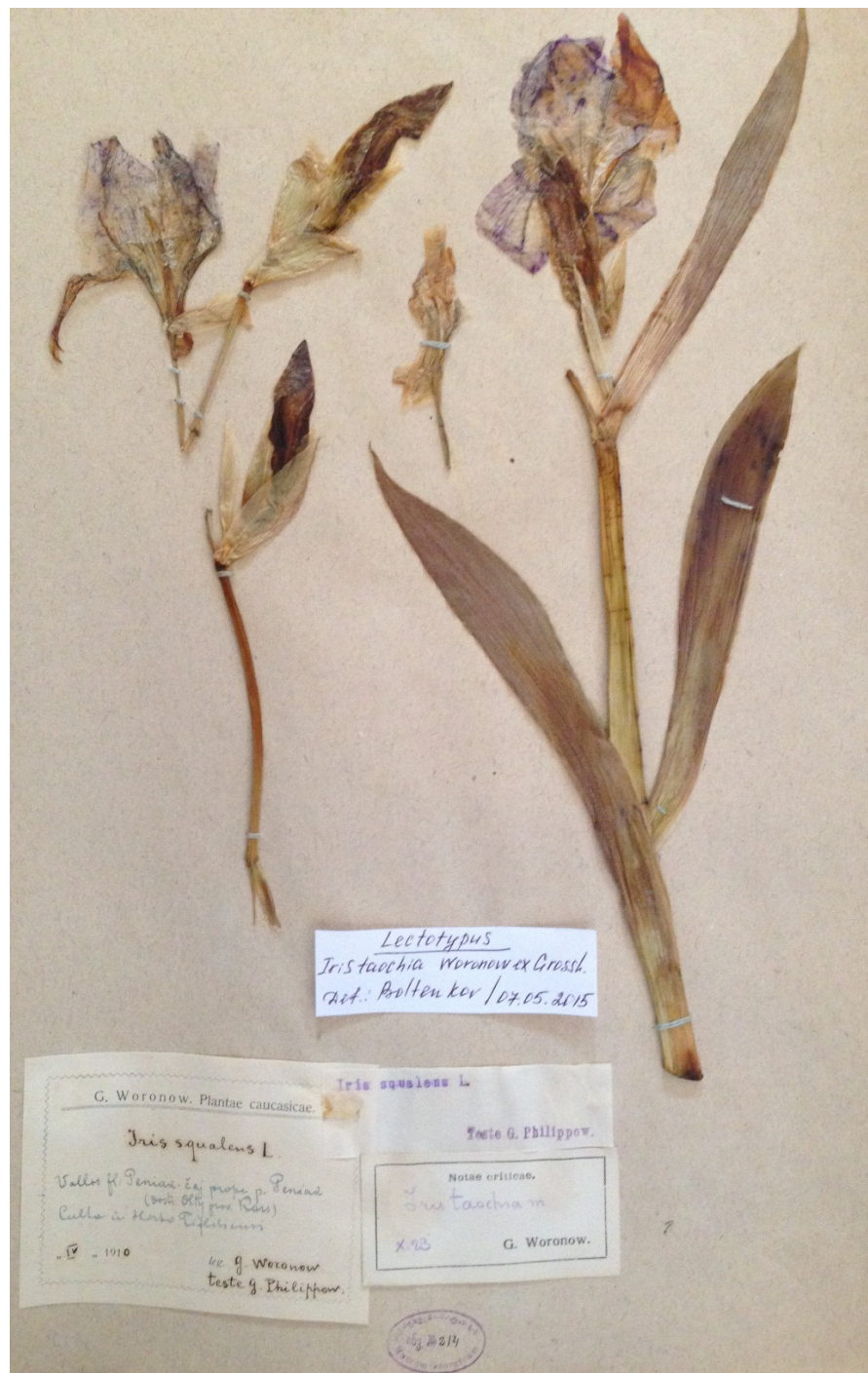
Figure 6. Lectotype of Iris taochia (TGM no. 214), by permission of the Curator.

information, we found Woronow's specimens at TGM. All the selected specimens are accompanied by a printed label with the note "Notae criticae. G. Woronow", on which Woronow handwrote " Iris taochia m. October [19]23". While preparing his work [40], Grossheim was in Tbilisi [42] and used the TGM collection. Hence, the TGM specimens, in our opinion, can be considered the original material of the name I. taochia . One of them (Figure 6) is designated here as lectotype because it matches the protologue and is the most informative one. Iris taochia is a narrow endemic species to Erzurum Province, Turkey. In addition to Oltu District, it has been recorded from the vicinity of Tortum [4,39].