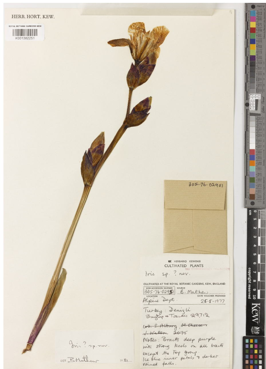
Figure 4. Lectotype of Iris purpureobracteata (K001382251). Reproduced with the consent of the Royal Botanic Gardens, Kew.

L. [12]. A suggestion was also made that it has an ancient origin and is probably a form of I. germanica [12,30].