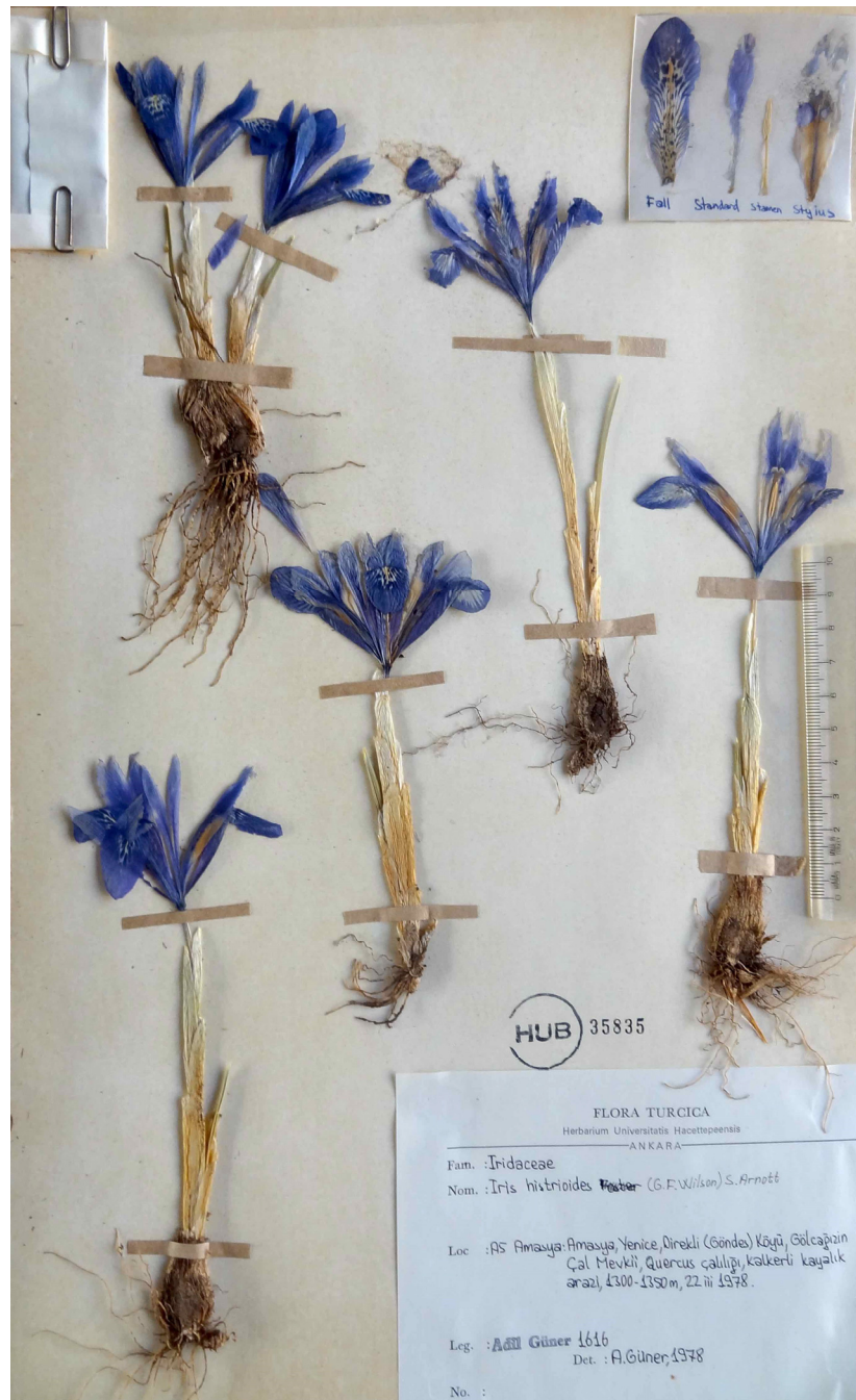
Figure 2. Neotype of Iris histrioides (HUB no. 35835), by permission of the Curator.

Notes — Iris histrioides was described by Gustavus Reuthe (Fox Hill Nursery, UK) from cultivated plants without indicating the collection locality [20]. The original material on which this name was based has not been found in the investigated herbaria. Therefore, a neotype may be selected according to the Art. 9.13 of the ICN. The neotype (Figure 2) is a complete specimen collected in Amasya Province, Turkey. It clearly shows the features of the inner perianth segments, the markings aggregated towards the centre of the lamina, which is characteristic of I. histrioides . Iris histrioides is an endemic to Turkey, distributed in the Amasya, Gümüşhane, Rize, Samsun, Sinop, and Tokat provinces (also see [10,21,22]).