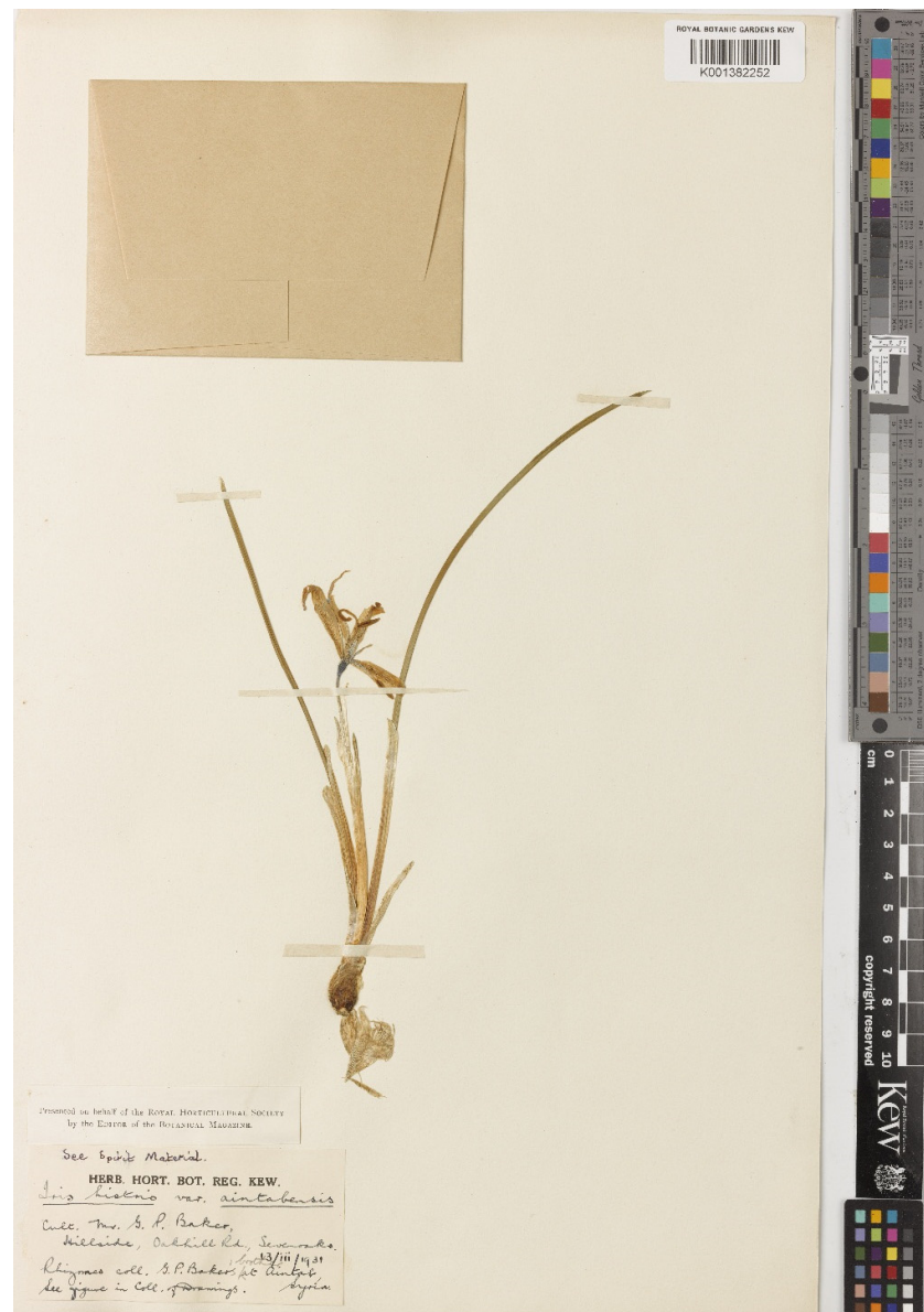
Figure 7. Lectotype of Iris histrio var. aintabensis (K001382252).

years and has come to the conclusion that there are no morphological differences between I. histrio var. aintabensis and the autonymic variety, as the colour pattern of the blade is very variable within the species.