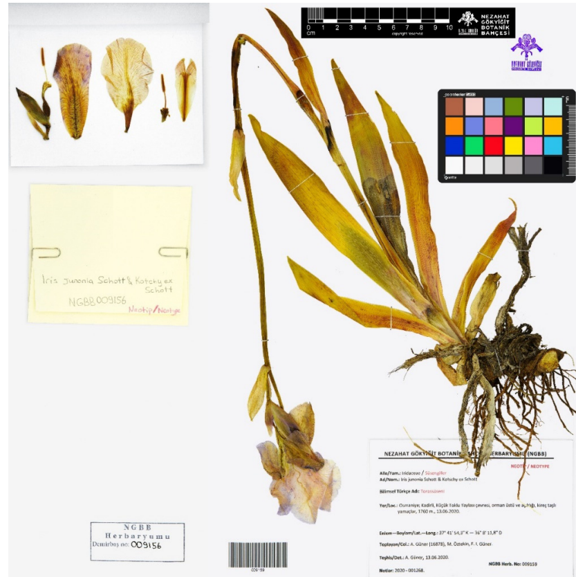
Figure 3. Neotype of Iris junonia (NGBB009159), by permission of the Curator.