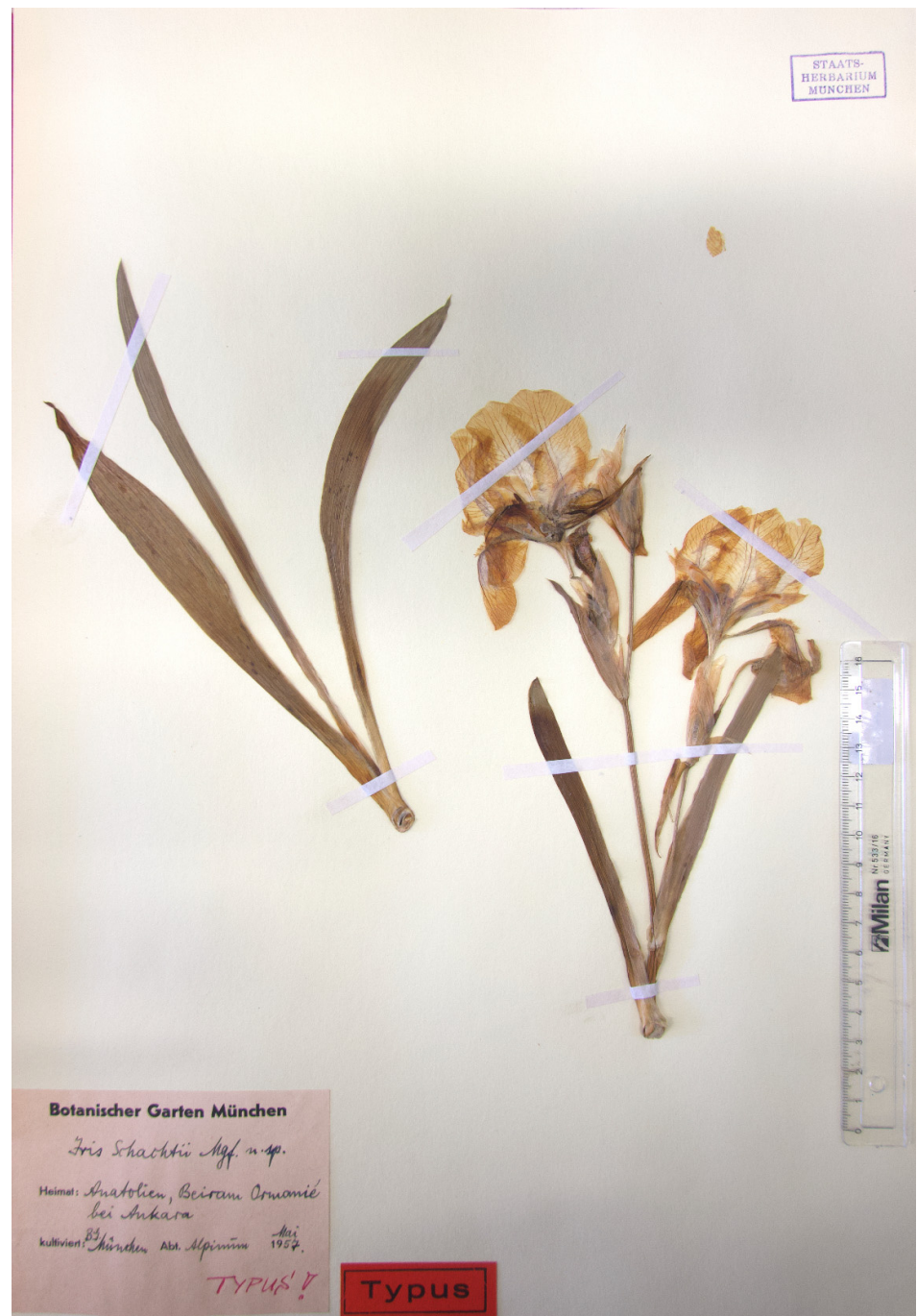
Figure 8. Lectotype of Iris schachtii (M), by permission of the Curator.