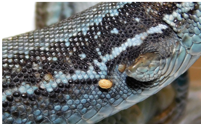
Figure 2. Three ixodid ticks attached to Darevskia praticola .

Other hosts: reptiles and birds are hosts for immature ticks, while large mammals, including cattle and sheep, are