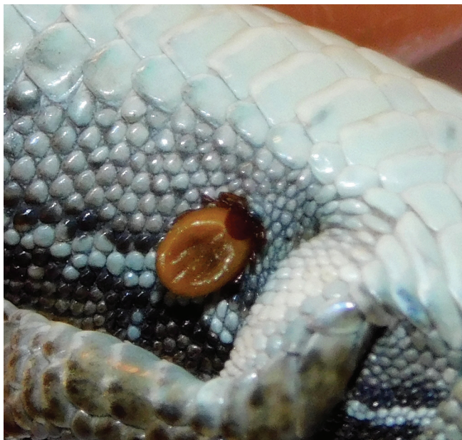
Figure 1. Ixodid tick attached to the host.