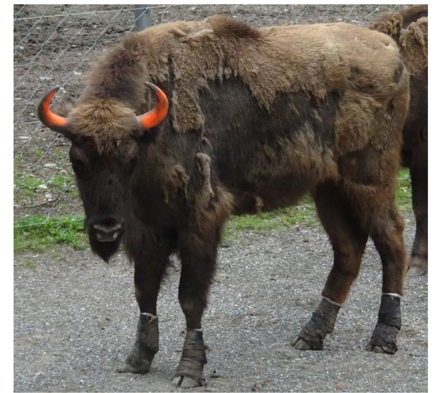
European bison with therapeutic bandages on all four feet.