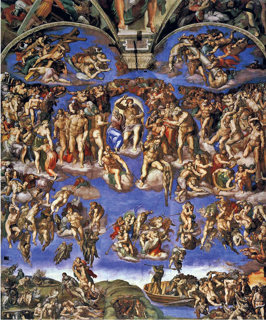
Fig. 10: Michelangelo Buonarroti: Last Judgment , 1536–1541, fresco, Sistine Chapel, Vatican City.

erful representation of the Last Judgment (Fig. 10). Among the sources relating to this fresco, there exists also a description of the final day in the Gospel of Matthew, in which the following line also appears: “Vigilate ergo, quia nescitis qua