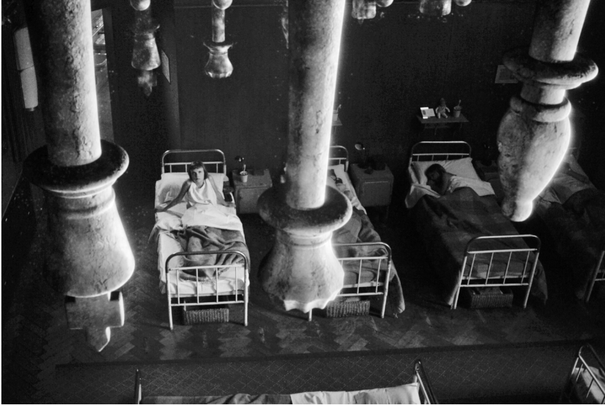
Fig. 2: Nocturnal vigils of Beth Harmon, screenshot from recurring scene in THE QUEEN'S GAMBIT (USA 2020).

ingly enough, this recommendation by Leonardo comes to mind when orphan chess prodigy Beth Harmon, the main character in the recent American miniseries THE QUEEN'S GAMBIT (2020) studies her adversaries' moves in a series of visionary nocturnal vigils (Fig. 2) – a scene that, along with the reception of Leonardo's writings, would call into question the relationships between vigilance and the notion of intellectual prodigy or 'genius' as shaped by Romance cultures since the 19th century.