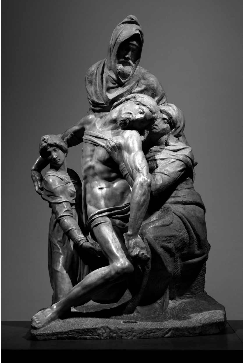
Fig. 9: Michelangelo Buonarroti: Pietà Bandini , ca. 1547–1555, marble, Museo dell'Opera del Duomo, Florence.