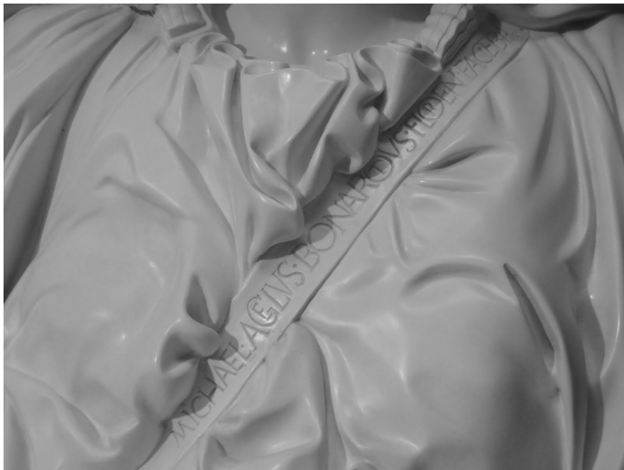
Fig. 8: Michelangelo's signature, Detail of Michelangelo Buonarroti: Vatican Pietà , 1497–1499, marble, San Pietro, Rome.

turata grande in front of the Palazzo del Podestà. The artist would only enter the palace at night, so as not to be seen painting the images of the Florentine bandits. 40