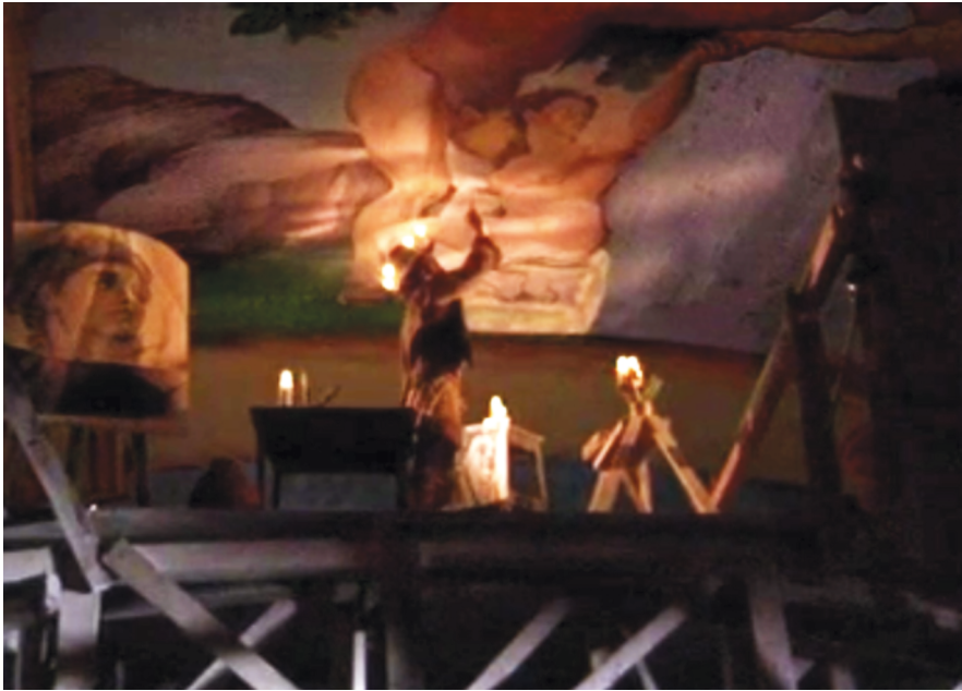
Fig. 6: Michelangelo working at night in the Sistine Chapel, screenshot from Carol Reed, THE AGONY AND THE ECSTASY (USA, 1965).

ing. 30 Michelangelo's quality of being "most vigilant", on the one hand, is the result of a physiological "sobriety" (literally, according to Vasari, a sober diet consisting in eating and drinking very little); on the other, this hyper-vigilance cannot be reduced to (mere) physiological insomnia. To be "most vigilant and of very little sleep" is instead an active status that revolves around a type of absorption (or, as the Wittkowers would have put it, obsession) with work, but is also a spiritual condition. It is, in fact, no coincidence that in Vasari's text this description of Michelangelo's character immediately follows the mention of both his relationship with his lady-friend Vittoria Colonna and his profound knowledge of the Bible ("dilettosi molto della Scrittura Sacra").