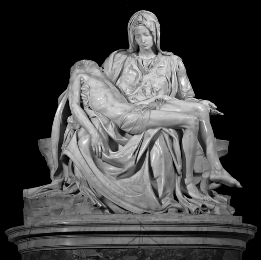
Fig. 7: Michelangelo Buonarroti: Vatican Pietà , 1497–1499, marble, San Pietro, Rome.

el. 38 The Bolognese artists, envious of the success of their Ferrarese rival (and of foreign artists in general), “s’accordarono con un legnaiuolo [...], et in chiesa si rinchiusero vicino alla cappella che egli faceva; e la notte in quella entrarono per forza, onde gli videro l’opera e gli rubarono tutti i cartoni, gli schizzi et i disegni.” 39 In this case, as Ercole de’ Roberti had concealed his work, rival painters broke into the chapel in the middle of the night to steal his ideas, cartoons, sketches and drawings. A further example is that of Andrea del Sarto and his