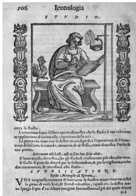
Fig. 4: Studio , woodcut. In: Cesare Ripa: Iconologia . Padua 1611.

young students to bring something of their hand and fantasia to the Academy, which would then provide an occasion of comparison among the students. This would give to them a special opportunity to make progress in the study, because the reciprocal emulation would make them “awake” and “vigilant” (“occasione d'affaticarsi, et studiare, più che forse non fanno per avventura, perché l'emulazione tra essi gli faria desti , et vigilanti , et si potrieno svegliare di bellissimo intelletti, che forse adesso stanno addormentati”). 20 In an academic context, this functions as a claiming of the intellectual skills that artists possess: by referring to studio and vigilance , Zuccari equates them to scholars and letterati . It is not of course a coincidence that in another of Zuccari's drawings, Studio is shown alongside Intelligence , thus representing two main virtues of an artist, and is, once again, represented with attributes of Vigilance , that is the cock and a lantern (Fig. 5). This emphasis on such intellectual skills corresponded to a collective effort, and one that had been ongoing since at least the Trecento, to raise the status of artists to that of other intellectuals. Similar recommendations with re-