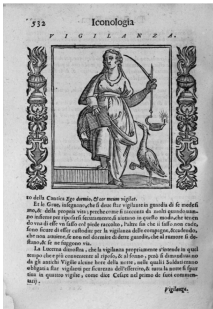
Fig. 3: Vigilanza , woodcut. In: Cesare Ripa: Iconologia . Padua 1611.