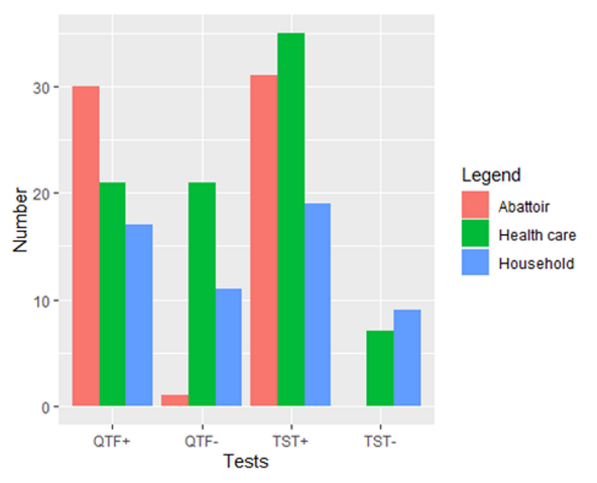
Figure 2. Distribution of latent tuberculosis infection (LTBI) according to the type of participant and LTBI test.

ina Faso, a low-income country with high incidence of TB (48/100,000 population).