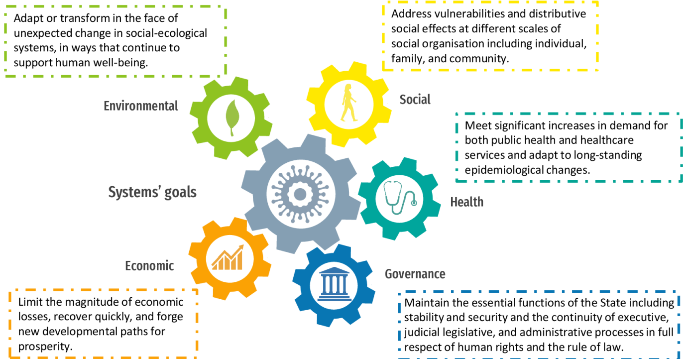
Figure 1 Interconnected societal systems and their different goals in addressing the COVID-19 pandemic.

governance functions and minimising any undesirable systemic effects. This definition encompasses the capacities of societies to (1) prepare, prevent and protect before disruption; (2) mitigate, absorb and adapt during disruptions; and (3) restore, recover and transform after disruption. 6