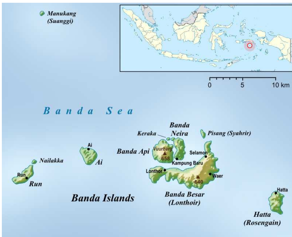
Figure 1. Map of the Banda Islands. (Made by Lencer CC BY-SA 3.0). 2

As the present residents of the Banda Islands will proudly proclaim, this small archipelago in the province of Maluku in modern-day Indonesia were once in great demand for their spices, as it was here the best quality nutmeg and mace were produced (see Figure 1).