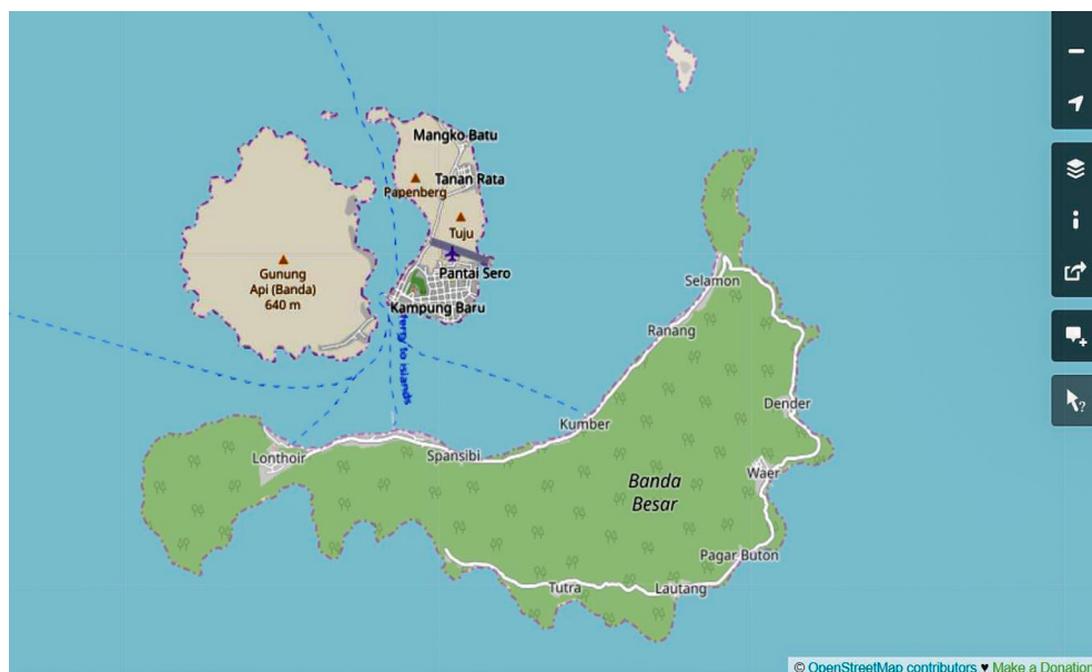
Figure 5. This is a screenshot of the same section, but then from OpenStreetMap. The non-existent island is not present, moreover, the islands are named correctly and there is more information included about the various villages.

On the satellite view, the location of the supposed island is covered by a cloud, which is probably the reason for this error. If this section is compared to the same area on OpenStreetMap, however, it is as clear as daylight that this latter map already contains more accurate information (see Figure 5).