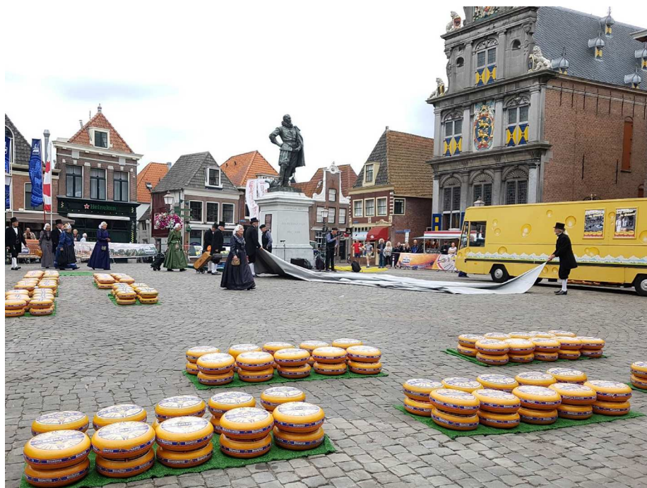
Figure 2. Picture of the central plaza in Hoorn, during a cultural festival commemorating the history of trade in cheeses. The statue of Jan Pieterszoon Coen is clearly visible as the central marker of this plaza, with to the right the Westfries Museum in which an exhibit is included that describes the controversy surrounding this statue.

Amsterdam, another recurring topic in the debate is the Coen Tunnel. This tunnel, the Coen Bridge on Highway A8 and the Coen Junction are named after the nearby Coen Port, hence all were named after Jan Pieterszoon Coen (Stiksma and Smit-Kroes 1987). The first part of the tunnel was built in 1966 and an additional three lanes were added and completed in 2014. Besides these public works, many streets across the country are named after Jan Pieterszoon Coen.