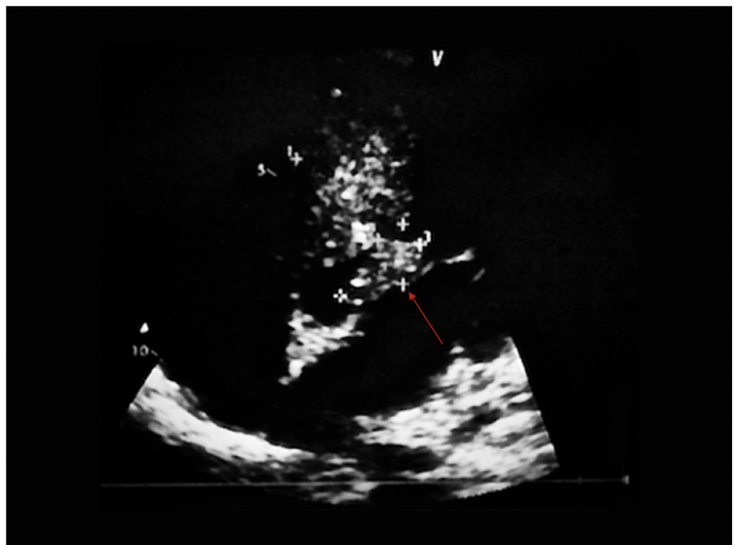
FIGURE 1: Parasternal long axis view on transthoracic echocardiogram showing a mass extending into the left ventricular outflow tract (LVOT).

The patient was taken to the operating room and successfully underwent right femoral embolectomy for acute limb ischemia. On the first postoperative day, the patient developed blurry vision in his left eye. A CT head without contrast showed no evidence of acute intracranial pathology. Due to concerns for cardiac source of systemic embolization a transthoracic echocardiogram (TTE) was done which showed a 12 \times 10 mm mass hanging from the sub-aortic septum extending into the left ventricular outflow tract (LVOT) (Figure 1).