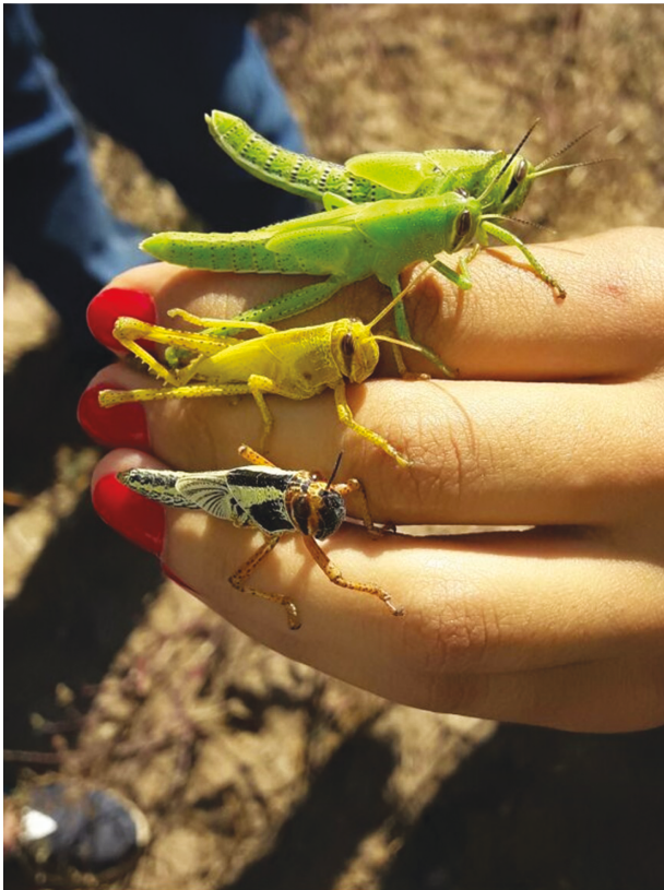
Fig. 1. Phase Polyphenism in Schistocerca cancellata . The chromatic phasic polyphenism of the nymphs is reversible. The image shows the gradual change in coloration from an aggregate nymph, with bright colors (lower nymph in the hand) to a solitary nymph with a cryptic color (upper nymph in the hand).

For the most part, Locusts seek open forest environments such as fields, pastures, and cultivation areas and some species live in association with shrub plants, such as some bromeliads (Barreto and Wandscheer 2017). Climatic factors are strongly related to the occurrence of locusts, considering that these insects prefer mild temperatures and sites for laying eggs directly on the ground (Pocco et al. 2019). Locust phase polyphenism is a remarkable form of phenotypic plasticity (Fig. 1) in which the expression of numerous physiological, morphological, and behavioral traits occurs in response to changes in local population density (Sword et al. 2010).