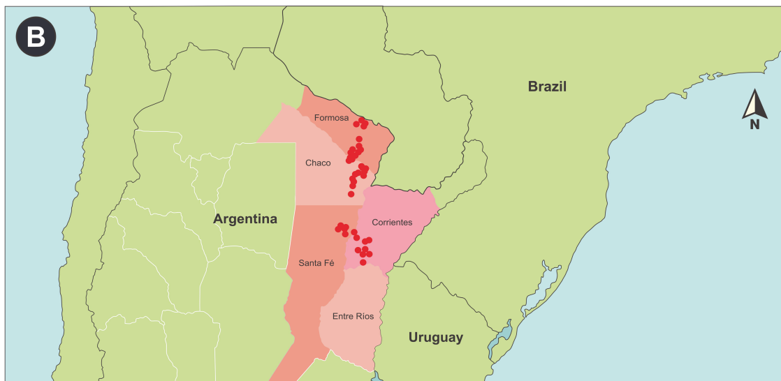
Fig. 2. Maps showing the great migrations of Schistocerca cancellata in the 1940s and 2019/2020s approaching the borders of Uruguay and Brazil.

spot, interrupted in the middle by a narrow, whitish stripe. The prosternal tubercle is wide and subconical. Open mesosternal space with rectangular mesosternal lobes. Tegmina is reddish-brown with numerous irregular brown spots. The apex of the tegmina extends beyond the end of the abdomen by twice the length of the pronotum. The second pair of wings are transparent, usually slightly rosy to pale yellow. Triangular epiproct with sides excurved; apical margin obtuse angle. Presence of tympanum. Absence of stridulatory structure in the male hind femur. Male subgenital plate with bifid tip. Circi subsquare with truncate apex. The lower basal lobes of the femur are shorter than the upper ones (Dirsh 1961, 1974; Rowell 2013).