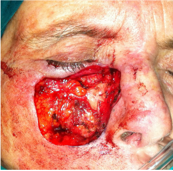
Fig. 1. Defect resulting from the resection of a long-standing basal cell carcinoma of the right peri-orbital–infraorbital–nasal area, with partial exposure of the right maxillary bone.