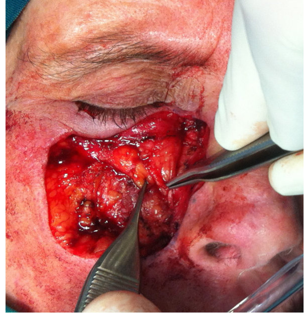
Fig. 2. Suborbicularis oculi fat flap advanced to cover the exposed right maxillary bone.

measuring 3.7\text{ cm} \times 2.1\text{ cm} with a portion of exposed maxillary bone measuring 1.5\text{ cm} \times 1.6\text{ cm} (Fig. 1). Intraoperative histology identified an aggressive BCC with tumour-free margins.