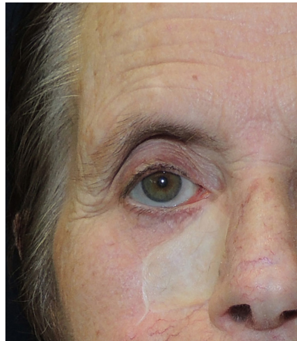
Fig. 4. No sign of local recurrence at 18 months of follow-up; a mild medial scleral show is present.