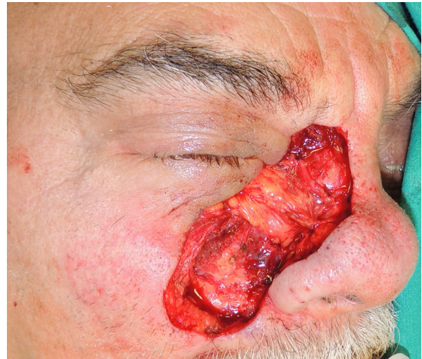
Fig. 6. Suborbicularis oculi fat flap advanced to cover the right nasal bone exposure.