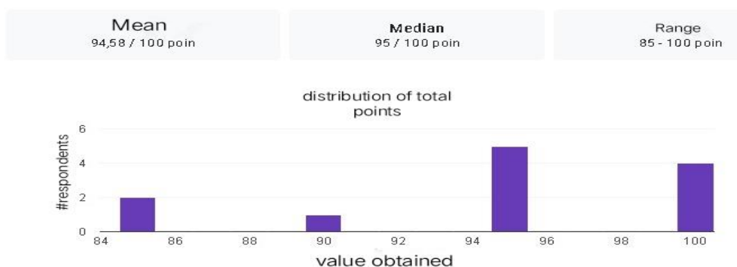
Figure 3. Results of post-test Scores

Figure 3 shows the results obtained during the post-test. Based on the data in the figure, it is known that the average score of Madrasah Diniyah Taklimiyah Awwaliyah Al Barkah students during the post-test was 94.58.