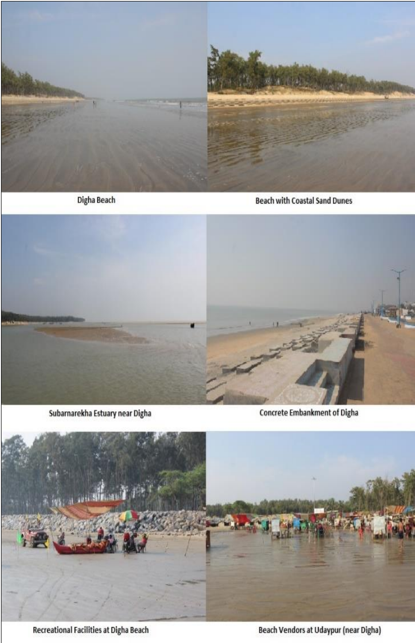
Fig. 2: Some Images of the Study Area.