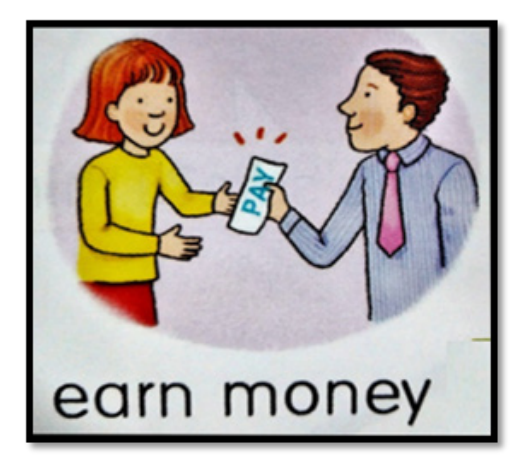
Figure 3: Male and female characters in a professional context

The data in Figure 3 shows stereotyped portrayals of males and females in the working sphere as found in the national ELT. The picture portrays the interaction of a woman and a man in a workplace as a sociocultural space. In this situation, the woman is receiving some money, probably her wage from the man because there is the word 'pay' written on the paper handed over. Since the woman's hands are pictured in a lower position than the man's, it could be further assumed that the female character works as an employee and the man plays the role of an employer. This assumption can also be strengthened by the analysis based on the perspective of the outfits worn by the two characters. It could be presumed that the man holds a higher professional position compared to the woman since he dresses more formally which can be observed from the presence of a tie as part of his apparel.