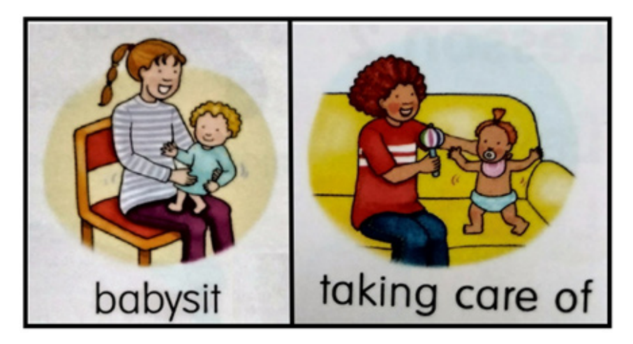
Figure 1: Two female characters doing childrearing activities

A closer look at the data reveals detailed information regarding the babies' ages and the parenting behaviour the two women demonstrate. In the first picture (on the left), the woman is holding the baby, placing her on her left leg with her hands around her body. From the way the woman places her left hand around her waist and the right hand on her tummy, she is trying to support her sitting position to prevent a possible fall. As shown by typical baby milestones that a baby nearing the independent sitting stage ages from seven to nine months (Dewar 2019), it could be hypothesized that the baby in the picture is one year old or younger and the activity is likely to be done regularly as the mother helps her baby practice to sit independently.