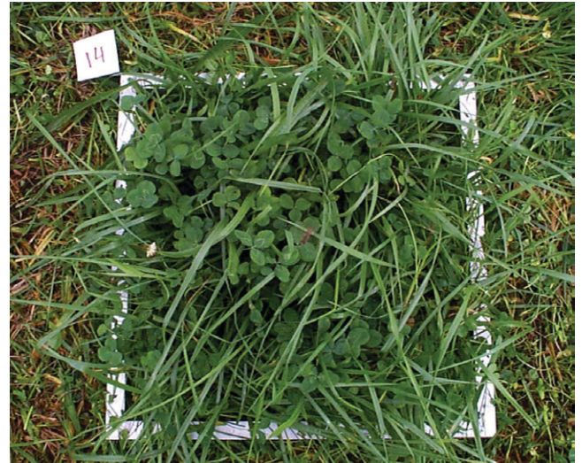
Figure 5. Sward containing 30% legume, 68% grass, 2% weeds, 9.5-inch canopy height, and 2000 lbs dry matter acre -1 forage mass.

of forage mass. Low forage mass was defined as less than or equal to 2000 lbs dry matter acre -1 . High forage mass was defined as greater than 2000 lbs dry matter acre -1 . Stand botanical composition of legume, grass, and broadleaf weeds, canopy ruler height (inches), and clipped forage mass (lbs dry matter acre -1 ) are listed for each photo (Table 1).