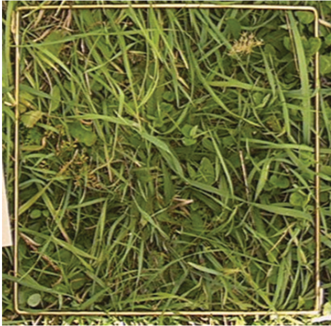
Figure 2. Sward containing 6% legume, 52% grass, 43% weeds, 5.0-inch canopy height, and 1180 lbs dry matter acre -1 forage mass.