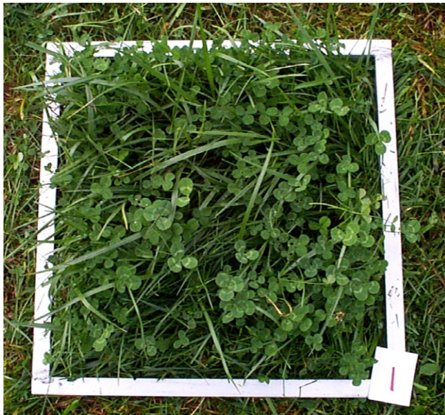
Figure 3. Sward containing 18% legume, 80% grass, 2% weeds, 7.5-inch canopy height, and 1775 lbs dry matter acre -1 forage mass.

quadrat was used. After the photo was taken, the forage within the quadrat was cut at 1.0 to 2.5 inches above ground level. At both locations, the forage was hand separated into grass, legume, broadleaf weed, and dead fractions. Botanical fractions were then oven dried. Botanical fractions are based on dry, live plant material.