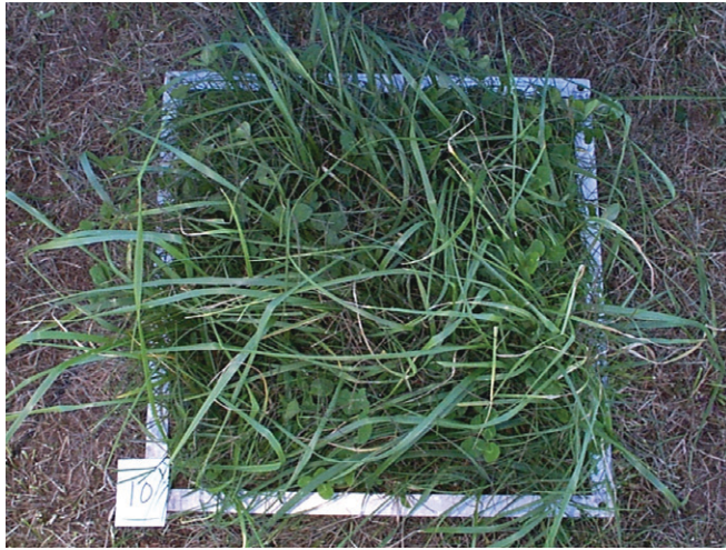
Figure 10. Sward containing 11% legume, 89% grass, 0% weeds, 12.0-inch canopy height, and 3600 lbs dry matter acre -1 forage mass.