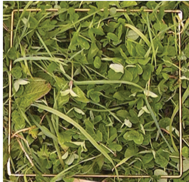
Figure 8. Sward containing 61% legume, 24% grass, 15% weeds, 7.5-inch canopy height, and 1780 lbs dry matter acre -1 forage mass.