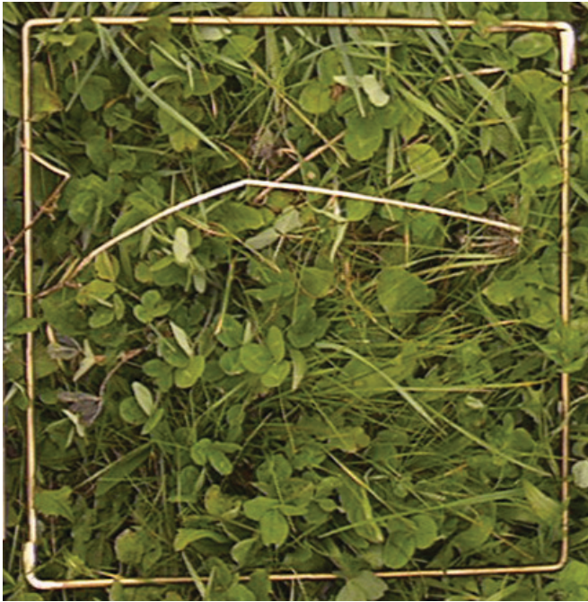
Figure 6. Sward containing 40% legume, 27% grass, 33% weeds, 8.0-inch canopy height, and 1880 lbs dry matter acre -1 forage mass.