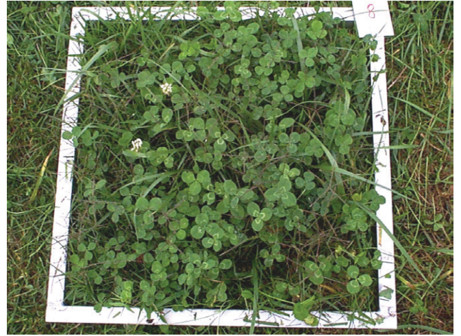
Figure 4. Sward containing 25% legume, 75% grass, 0% weeds, 6.0-inch canopy height, and 1400 lbs dry matter acre -1 forage mass.

Photos in the reference guide are presented in order of legume content from low to high (Table 1) within two ranges