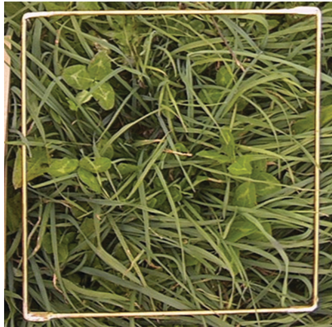
Figure 11. Sward containing 16% legume, 74% grass, 10% weeds, 16.5-inch canopy height, and 3270 lbs dry matter acre -1 forage mass.