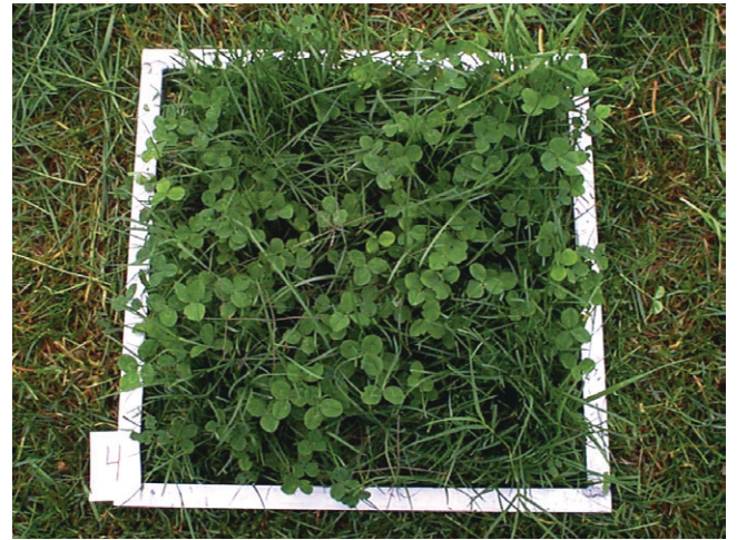
Figure 12. Sward containing 19% legume, 81% grass, 0% weeds, 9.0-inch canopy height, and 2150 lbs dry matter acre -1 forage mass.