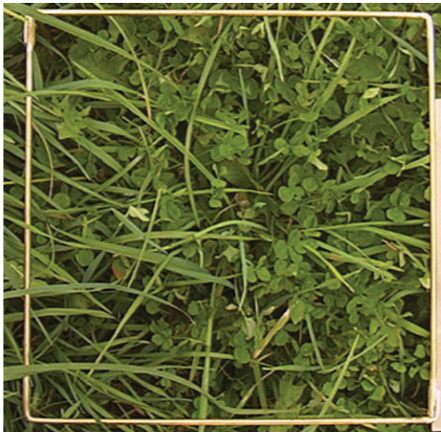
Figure 7. Sward containing 55% legume, 23% grass, 22% weeds, 7.0-inch canopy height, and 1677 lbs dry matter acre -1 forage mass.