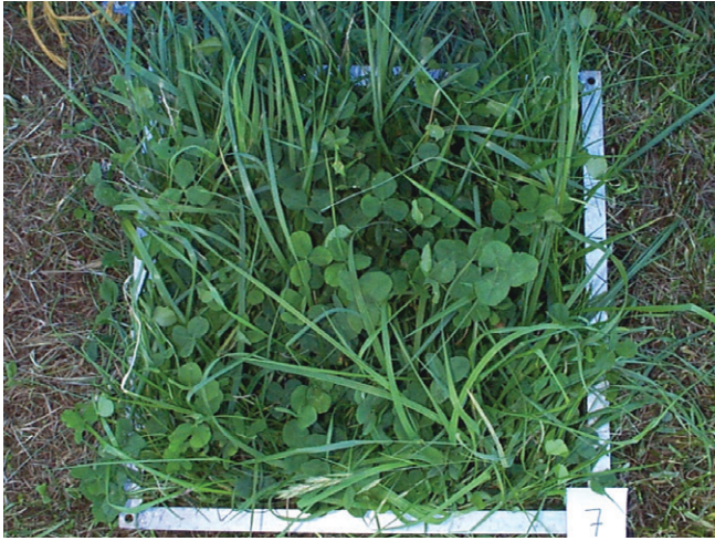
Figure 14. Sward containing 34% legume, 66% grass, 0% weeds, 10.25-inch canopy height, and 3550 lbs dry matter acre -1 forage mass.