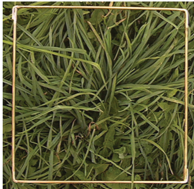
Figure 9. Sward containing 5% legume, 82% grass, 13% weeds, 13.0-inch canopy height, and 2950 lbs dry matter acre -1 forage mass.

ManagingForagesforAnimalProductionVPI%20Bul45.pdf (accessed 5 Feb. 2014).