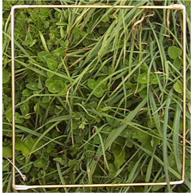
Figure 15. Sward containing 46% legume, 41% grass, 13% weeds, 8.0-inch canopy height, and 2150 lbs dry matter acre -1 forage mass.