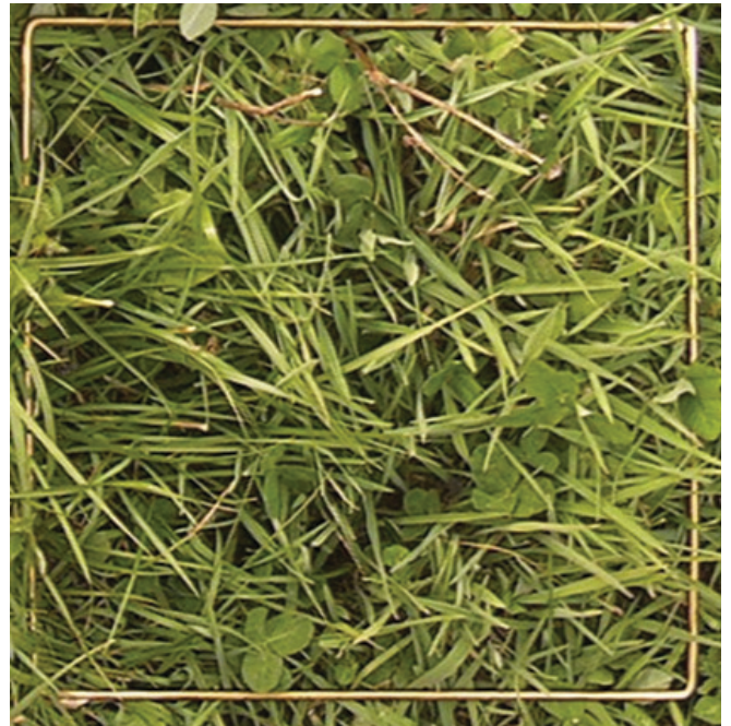
Figure 13. Sward containing 25% legume, 73% grass, 2% weeds, 9.5-inch canopy height, and 3230 lbs dry matter acre -1 forage mass.

Rayburn, E.B., M.S. Whetsell, and P.I. Osborne. 2006. Calves weaned and backgrounded on pasture respond to pasture nutritive value and supplements. Online. Forage & Grazinglands , doi:10.1094/FG-2006-0719-01-RS