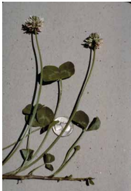
Figure 1. White clover has "runners" or stolons that provide a secondary root system and energy storage for regrowth and grazing tolerance.

ent density. In addition, the higher level of magnesium in clovers decreases the potential risk of grass tetany in the spring months. The majority of tall fescue in Georgia is infected with a toxin-producing fungus that diminishes animal performance (see Novel Endophyte publication). White clover interseeded into toxic tall fescue pastures can reduce intake of these toxins. Animals selectively graze the clover, thereby reducing consumption of the toxic grass. This, in combination with the improved diet quality of the clover, greatly improves performance of animals grazing toxic tall fescue (Table 2).