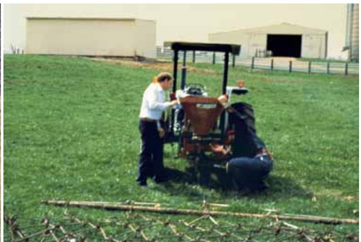
Figure 4. White clover can be established by sod-seeding with a no-till drill (left), broadcasting and dragging (right) or by broadcasting and trampling seed in with temporarily heavy stocking rates.