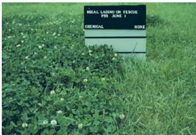
Figure 5. Regal white clover established in a dense stand of tall fescue with a “chemical frost” of paraquat to suppress grass (left) and without suppression (right).

(1) Remove excess forage and thatch just prior to seeding. This will prevent shading, improve seed-soil