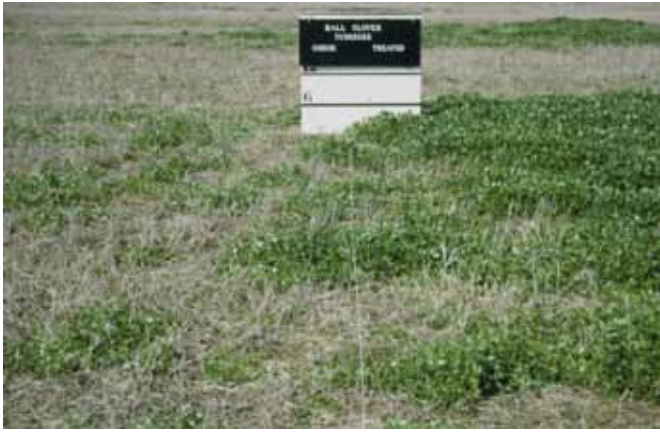
Figure 6. A stand of ball clover that was treated with insecticide (right) and not treated (left) at establishment to curtail insect damage. White clover would respond similarly when insect pressure is present in the fall.

(1) is desperately needed and (2) can be reliably and effectively removed with grazing to prevent shading of clover seedlings. If nitrogen is added to these stands, pastures must be grazed in a controlled manner to prevent grasses from out-competing clover. Conduct grazing in a manner that avoids or minimizes clover injury. If controlled grazing methods are not feasible, do not apply nitrogen during the establishment year. Adequate levels of phosphate and potash, on the other hand, are necessary for competitive and productive clover plants. It is critical to conduct a soil test and, if necessary, apply these nutrients for successful clover establishment and persistence.