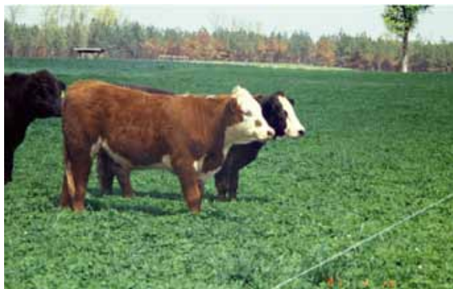
Figure 3. Beef steers grazing tall fescue overseeded with Durana white clover. As of 2003, this clover had persisted for 5 years at the Central Georgia Station near Eatonton, Ga. Approximately 45 percent white clover and 55 percent tall fescue on dry matter basis.

Performance of stocker steers grazing four year old pastures near Eatonton also demonstrates the benefits of Durana white clover persistence (Table 6). In this study, steers grazing toxic tall fescue and Durana gained almost 300 percent more per day and over 100 pounds more per acre than nitrogen fertilized toxic tall fescue. Regal ladino white clover had essentially failed as indicated by low average daily gains (no clover forage to offset intake of toxic tall fescue) and low gain per acre (low nitrogen fixation). We continued grazing the excellent Durana pastures (Figure 3) while Regal stands had to be reseeded. Tall fescue stands overseeded with Patriot at the Northwest Georgia Station have also persisted well and improved performance of animals grazing toxic tall fescue.