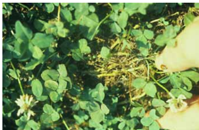
Figure 2. Dense stolons of Durana white clover provide energy reserves for regrowth and survival under heavy grazing.