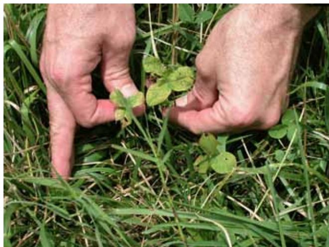
Figure 8. Two year old grazed white clover plant infected with a virus. Note yellow streaking pattern on the leaves.

Unfortunately the fear of bloat has prevented many producers from establishing perennial clovers in pastures. The lost animal performance from not including clovers, particularly in tall fescue pastures, greatly outweighs the improbable and infrequent losses from bloat when clovers are utilized. Bloating is rare — particularly when clovers make up less than 50 percent of available forage dry matter in a pasture. For reference, the forage in Figure 3 was made up of 45 percent white clover and 55 percent tall fescue on a dry matter basis. Stocker animals grazed this paddock in the spring and fall for four years with no incidence of bloat. Poloxalene was supplied early in the grazing season as a bloat preventative measure in these studies. It is uncommon for pastures to contain more than 50 percent clover in Georgia. The additional precautions below will further decrease bloat risks (Lacefield and Ball, 2000).